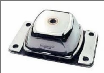
Anti Vibration Mount