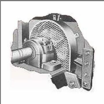
Air Cooled Bearings