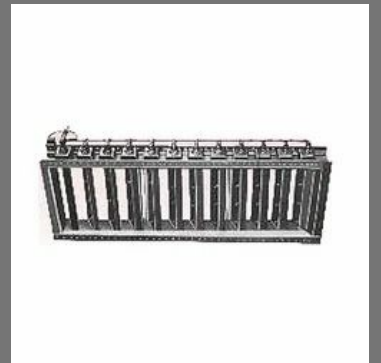
Multi Louver Damper