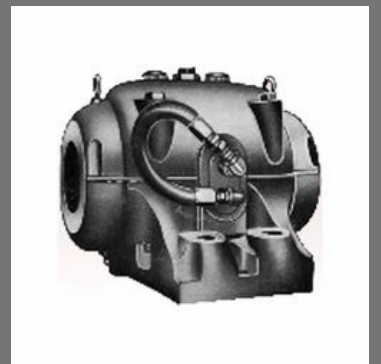
Water Cooled Pillow Block