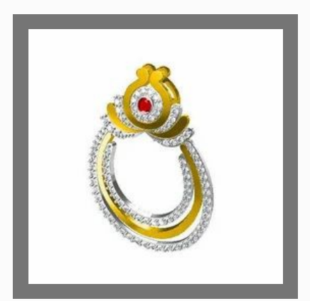
Party Wear Earring