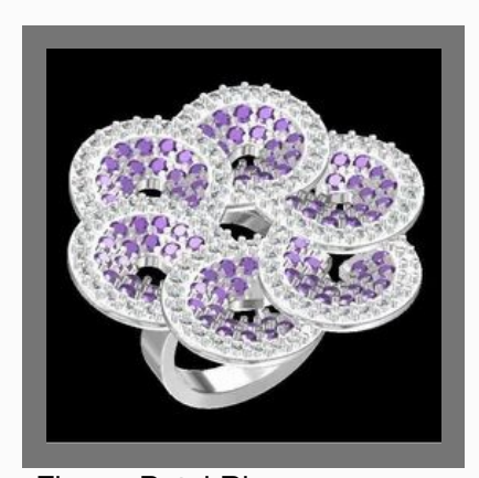
Flower Petel Ring