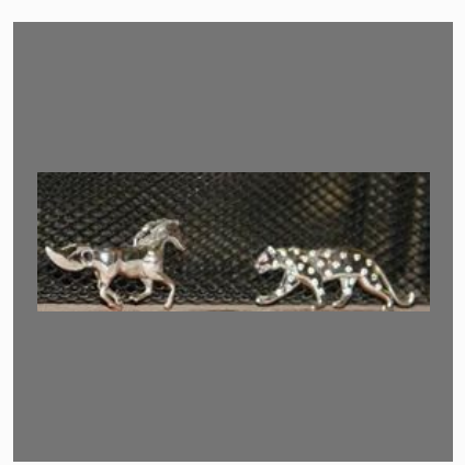
Tiger V/S Horse Jewellery