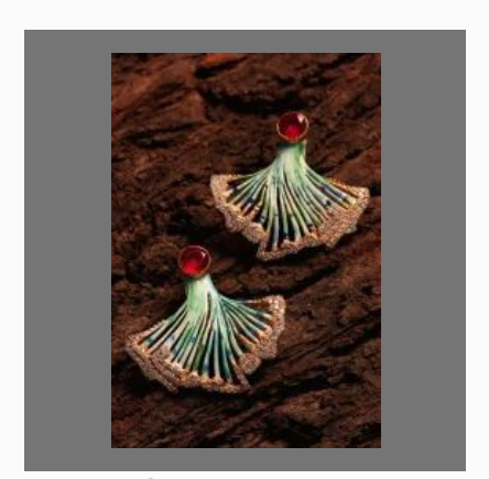
Nature Stone Jwellery