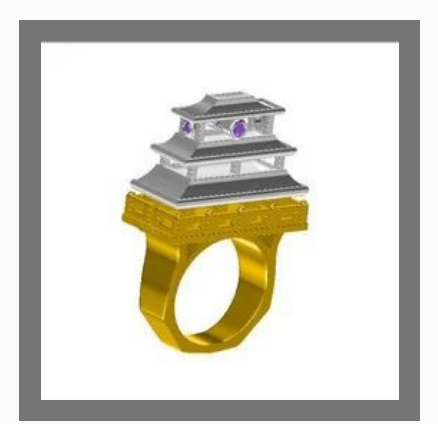
Hut House Ring