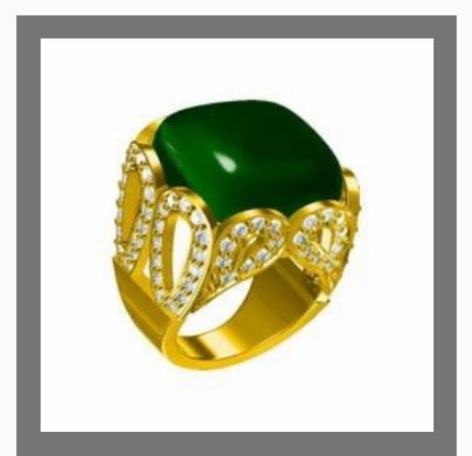
Designer Cocktail Ring