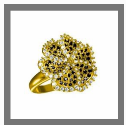
Party Wear with Black and White Diamond