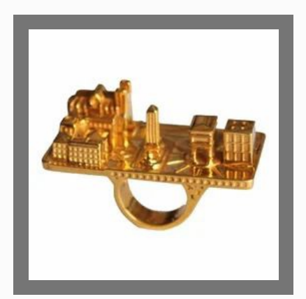
Platform of House Ring