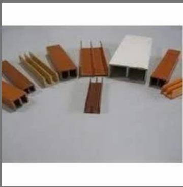
E Chanel Plastic Furniture Profile