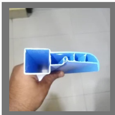
L Shape Angle