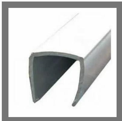
PVC Profile C Type