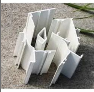
Plastic Section Profile