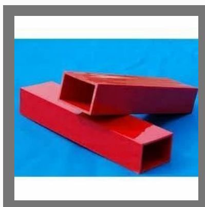
Plastic Square Pipe