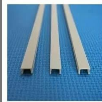
C Shaped Profile