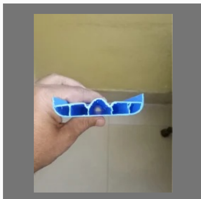
Pvc Extruded Profile