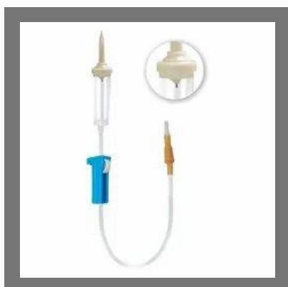
Infusion Set Vented with Y-Connector