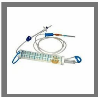
Measure Volume Set with Y-Connector