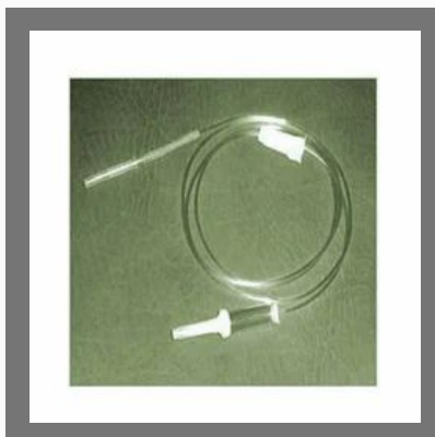
Infusion Non Vented Set