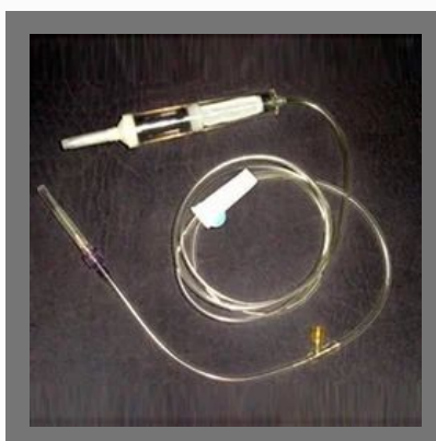
Blood Transfusion Y-Connector Set