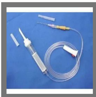
Blood Transfusion Set