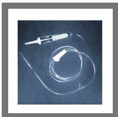
IV Infusion Set