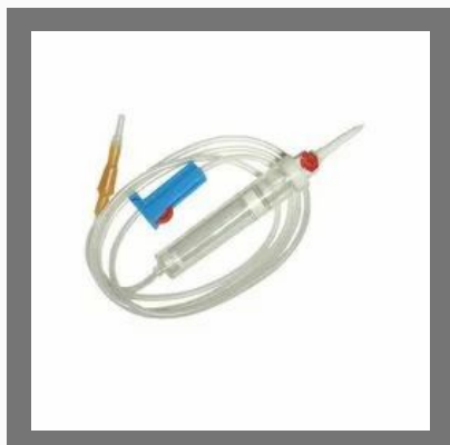
Blood tranfusion Set