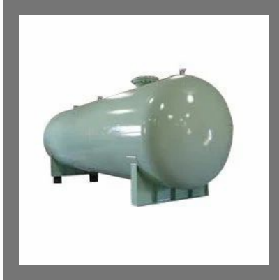
Vessel Fabrication Work