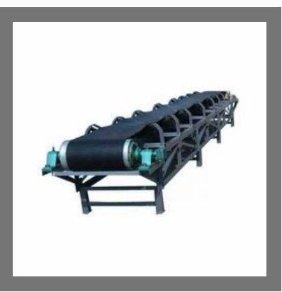
Belt Conveyor System