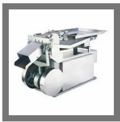
Tobacco Processing Machine