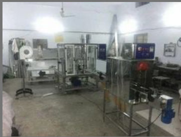
Mineral Water Bottle Filling Machine