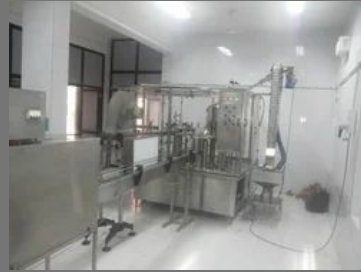
Pet Bottle Water Bottling Machinery