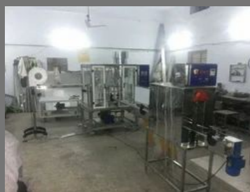
Mineral Water Bottle Filling Machine