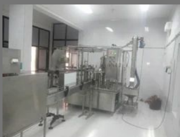
Automatic Mineral Water Bottle Rinsing Filling Machine