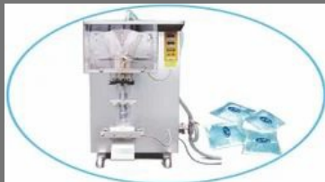
Water Bottle Filling Machine