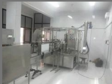
Mineral Water Bottle Filling System