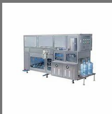
Automatic Water Jar Filling Machine