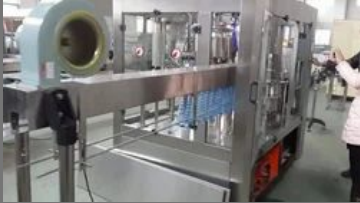
Mineral Water Packing Machine