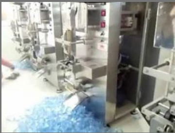
Water Packaging Machine