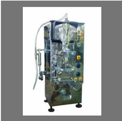
Automatic Mineral Water Pouch Packing Machine