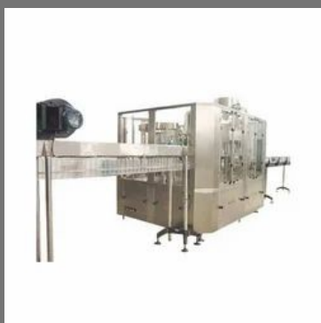
Automatic Rotary Gravity Capping Machine