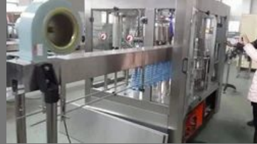
Mineral Water Filling Machine