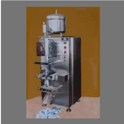
Water Pouch Packaging Machine