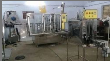
Packaged Drinking Water Machine