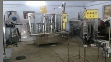
Packaged Drinking Water Plant