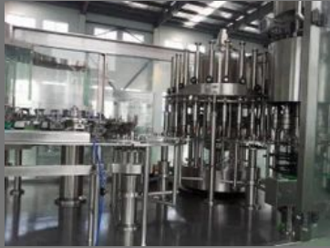
Water Bottle Filling Machine