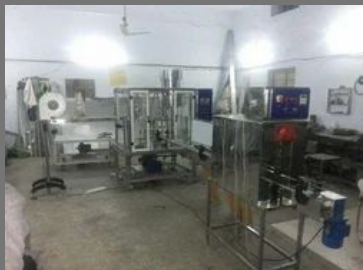
Mineral Water Bottle Filling Machine