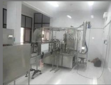
Mineral Water Bottle Filling Machine