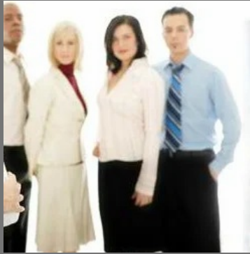
Web Related Services