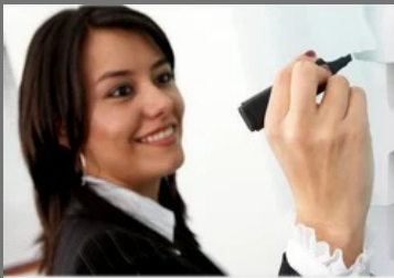
Analytics And Market Research