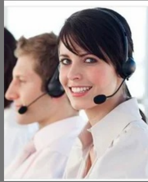
Interactive Design Service