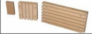
Ceramic Supporting Plate