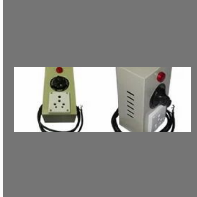
Electric Control Panel