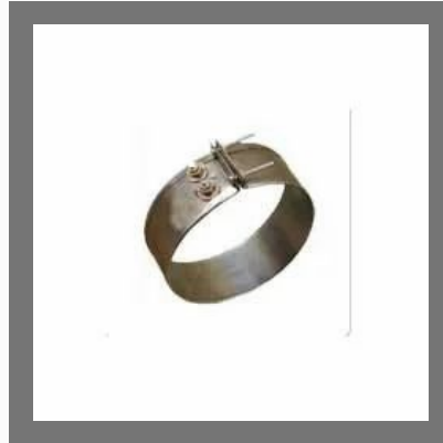
Electric Band Heater