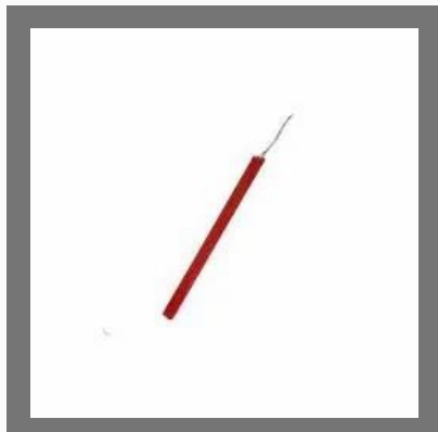
Electric Flexible Heater