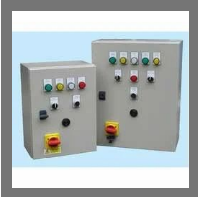
Electrical Control Panel