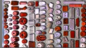
Ceramic Insulator Hook