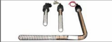
Industrial Glass Heater