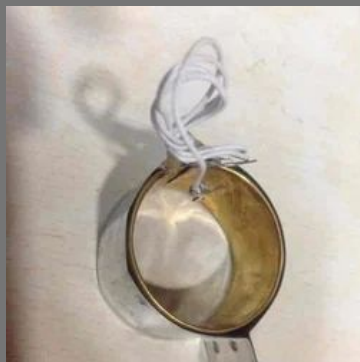
Pouch Packing Machine Heater