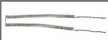
Electrical Coil Heater