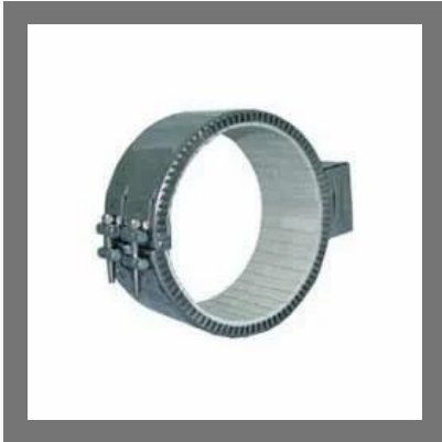
Ceramic Band Heater