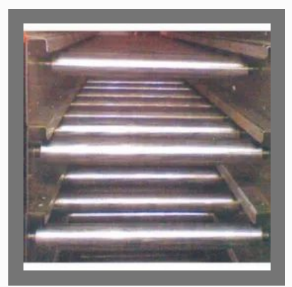
Chain Driven Roller Conveyor