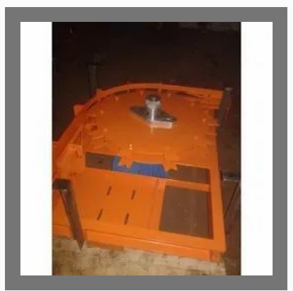
Powder Coated Conveyor Drive Unit