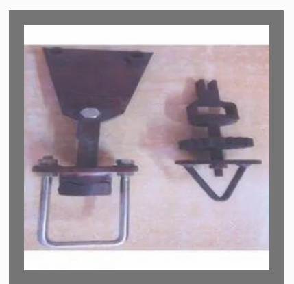
Overhead Conveyor Moving Indexer