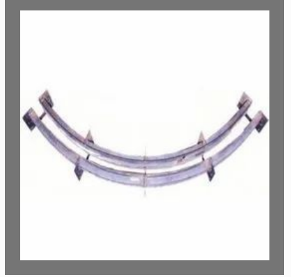
Overhead Conveyor Vertical Bend