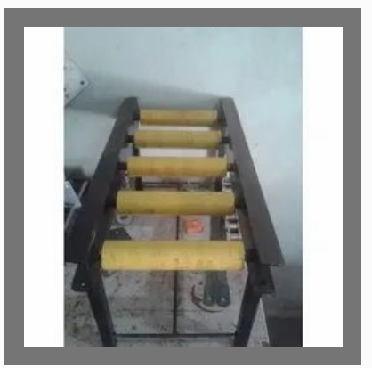
Gravity Roller Conveyor