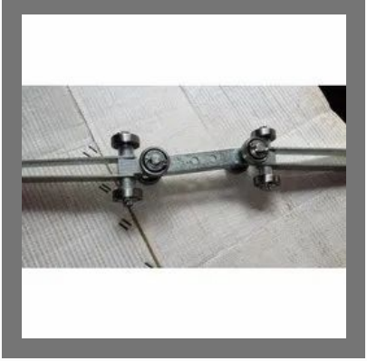
Mini Super SS Conveyor Chain