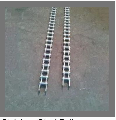
Stainless Steel Roller Conveyor Chain