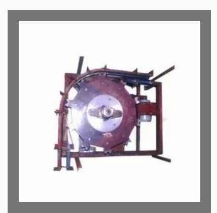
Conveyor Sprocket Type Drive Unit