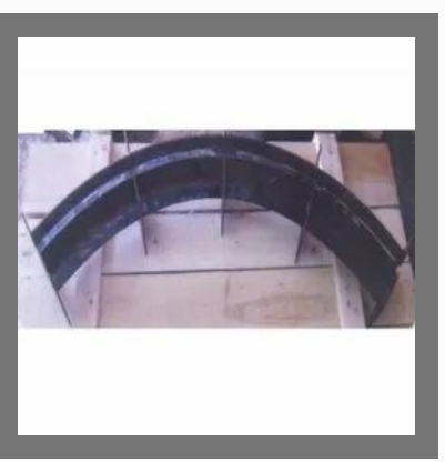
Mini Overhead Conveyor Bend