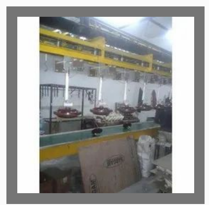
Overhead Fan Testing Conveyor