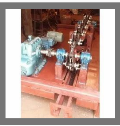
Overhead Conveyor Drive Unit