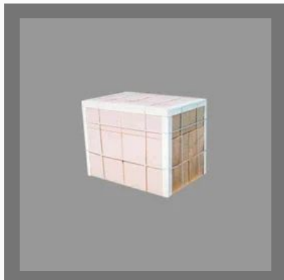
Paper Angle Board