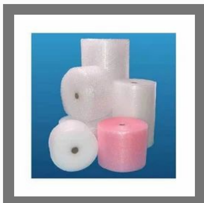
Air Bubble Bag & Sheet