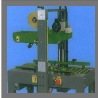
Carton Sealing Machines