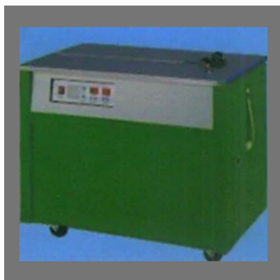
Semi Automatic Strapping Machines