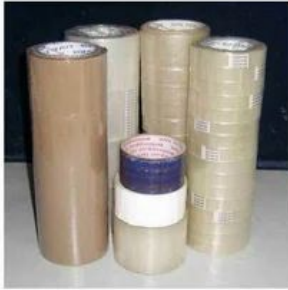
All Types Of Adhesive Tapes