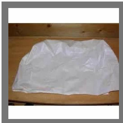
LD Machine Cover