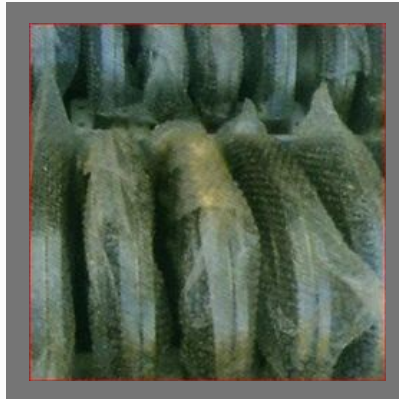
Air Bubble Bags And Cut Sheets