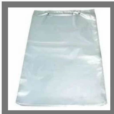
LD Plastic Bags