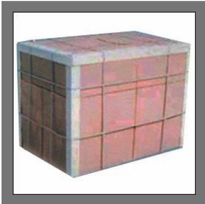
Paper Angle Boards