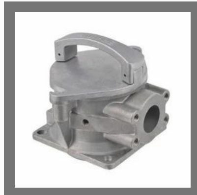
Manganese Steel Casting