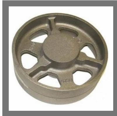
Cast Iron Casting