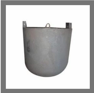
Cast Iron Crucible Casting