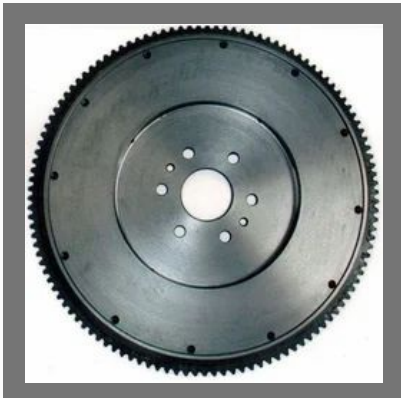
Cast Iron Flywheel