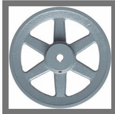
Custom Cast Iron Flywheel