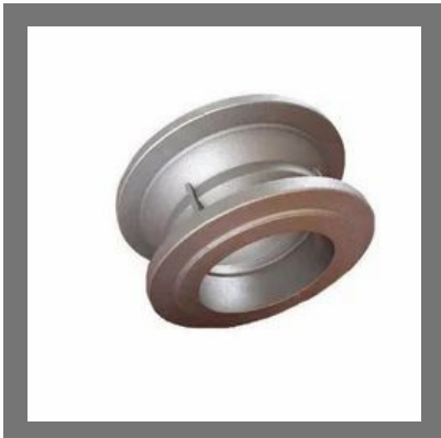
Mild Steel Casting