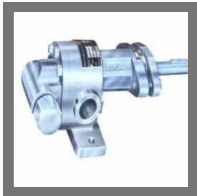
Rotary Gear Pumps