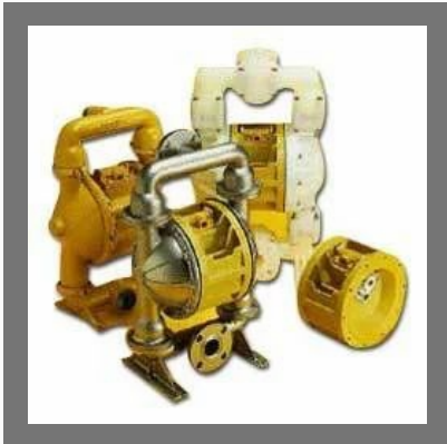
Air Operated Double Diaphragm Pumps