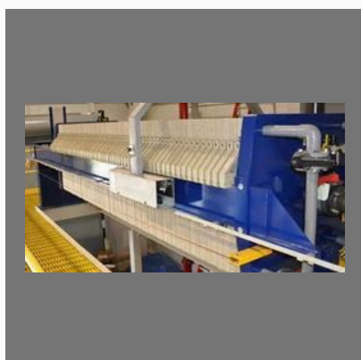
Sludge Dewatering Filter Press