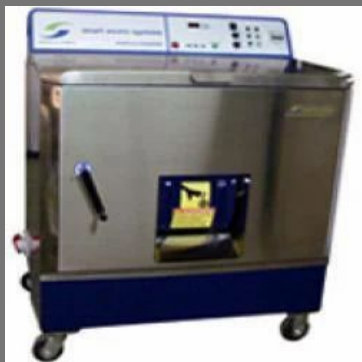
Batch Composting Machines