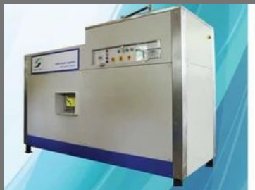
Smart Xpress Compressors