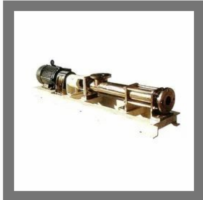
Progressing Cavity Type Screw Pumps