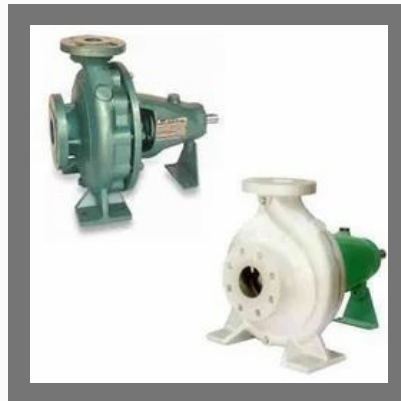
Back Pull Out Chemical Process Pumps