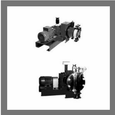
Hydraulically Operated Dosing Pumps