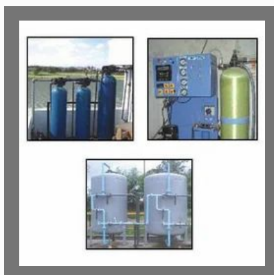
Water Treatment Plant