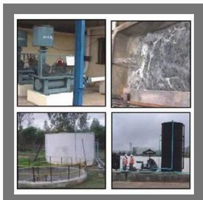
Sewage Treatment Plant