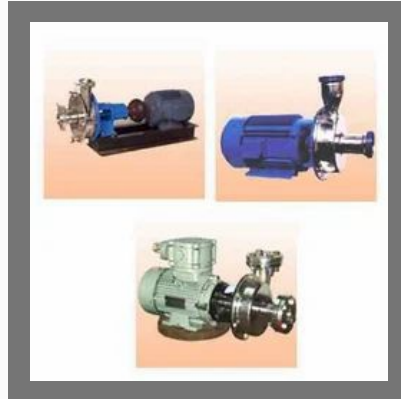
Sanitary Centrifugal Pump