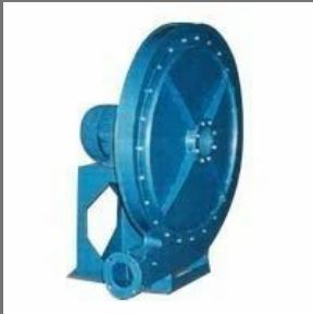
Direct Drive Blowers