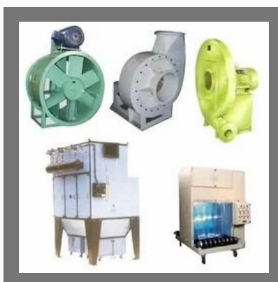
Fans/ Blowers/ Equipments