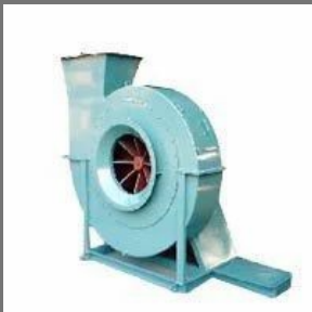
Induced Draft Blowers