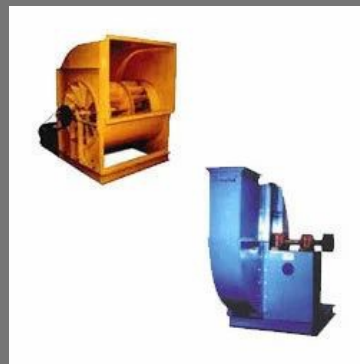
Belt Drive Blowers