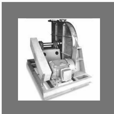
Forced Draft Blowers