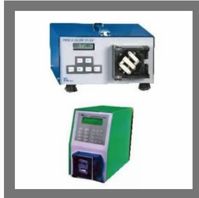
Peristaltic Pumps/ Tubing Pumps