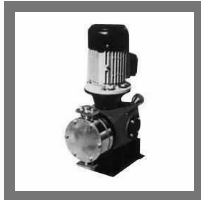
Mechanically Operated Diaphragm Pump