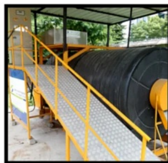
Smart Drum Composter