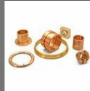
Non Ferrous Metal Components