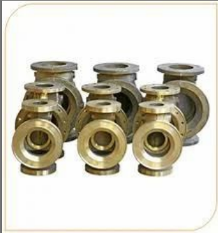
Aluminum Bronze Casting