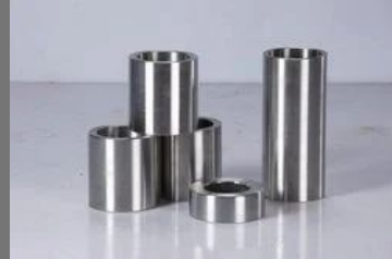
Aluminium Bronze Centrifugal Casting