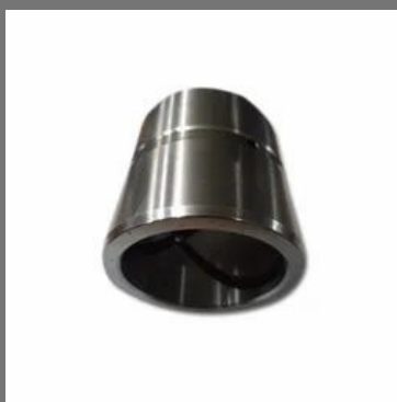
Tractor Hydraulic Bush