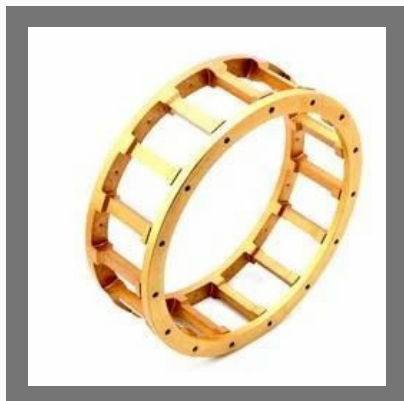
Cylindrical Roller Bearing Cages