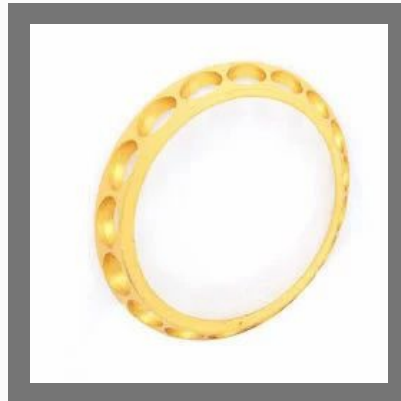
Angular Contact Roller Cages