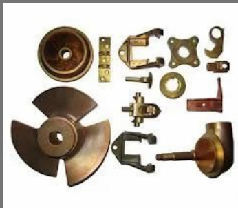
Copper and Brass Alloys Casting