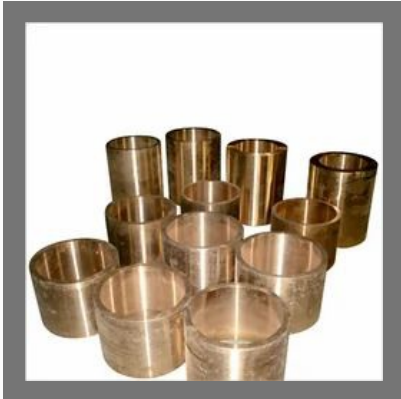
Industrial Bronze Bushes