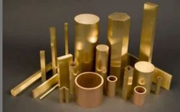
Non Ferrous Sheet Metal Components