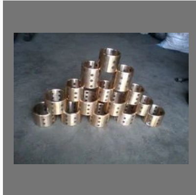
Graphite Filled Bush