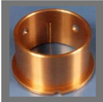
Phosphorus Bronze Bushes