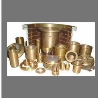
Lead Bronze Bushes