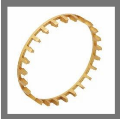
Steel Cage Spherical Roller Bearings