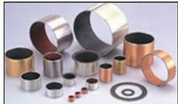
Hydraulic Press Bush