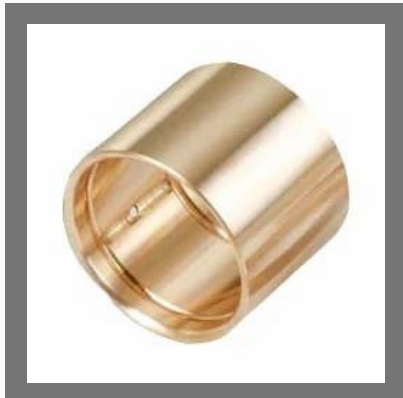
Gunmetal Bronze Bushes