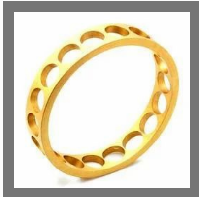
Brass Bearing Cages