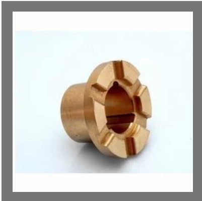
Brass Bearing Cages