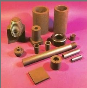
Non Ferrous Metal Component