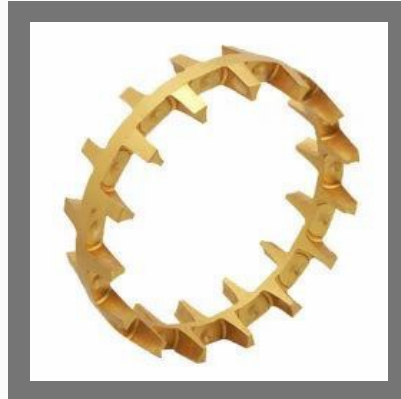
Spherical Roller Bearing Cages