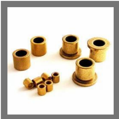
Sintered Bronze Bushes