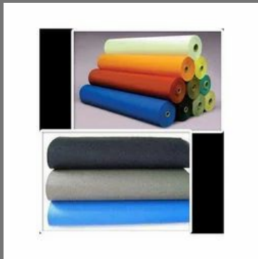
TPU Coated Fabric