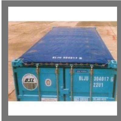
Open Top Container Cover Tarpaulin