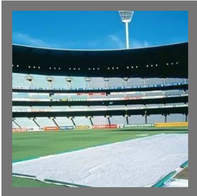
Cricket Pitch Covers