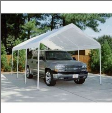
Automobile Canopy Cover