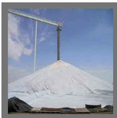
Agricultural Storage Covers