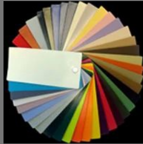
Technical Textile Fabrics