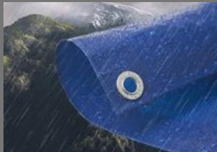
PVC Hot Laminated Tarpaulin