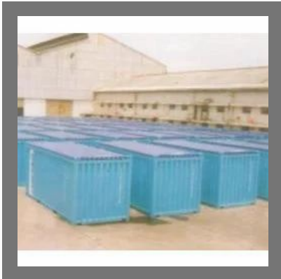
Shipping Container Covers