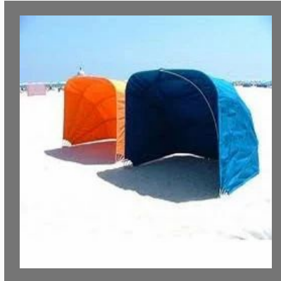
Hood and Soft Top Canopy