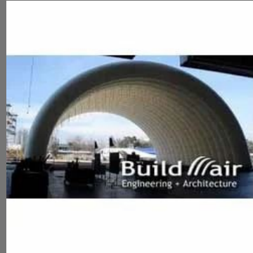
Inflatable Hangar Cover