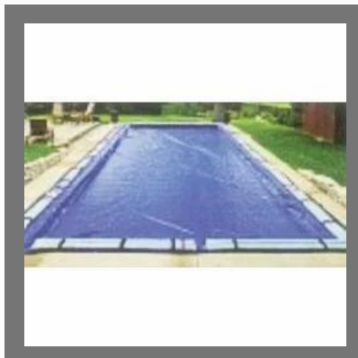
Swimming Pool Covers