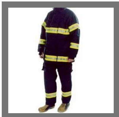
Fire Fighter Suit