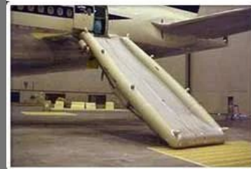
Rafter - Aircraft Emergency Escape Slide