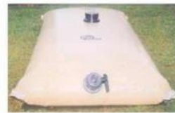
Flexible Water Tank