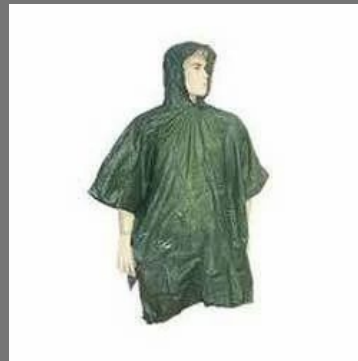
Multipurpose Poncho Suits