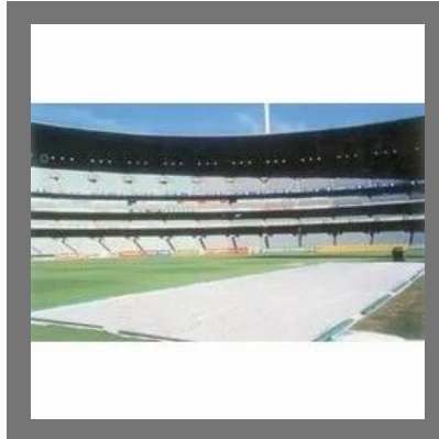
Cricket Pitch Cover