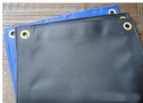
PVC Coated Tarpaulin