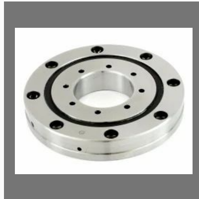
Cross Roller Bearings