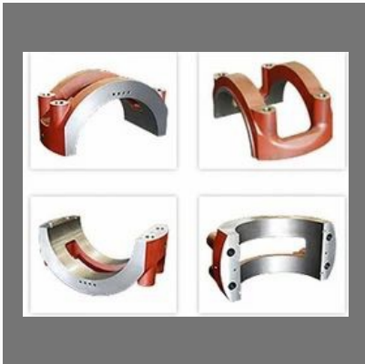
Cross Head Bearing