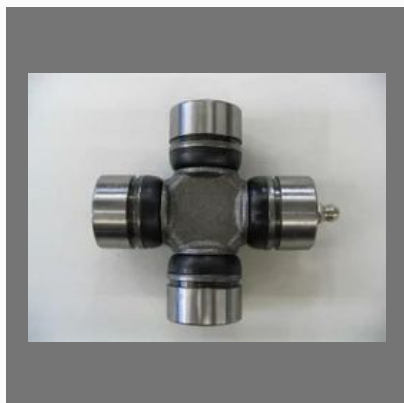
Heavy Duty Universal Joint Cross