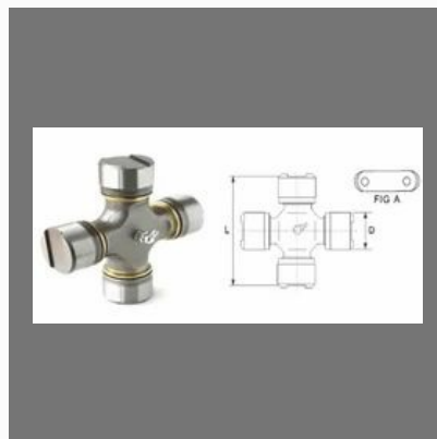
U- Joint Cross