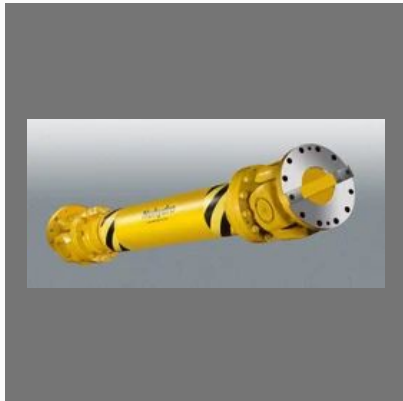
Universal Joint Shaft Components