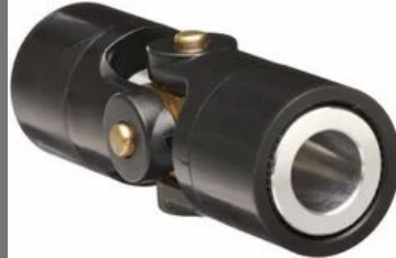
Universal Joint Couplings