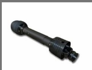
Comer PTO Drive Shafts