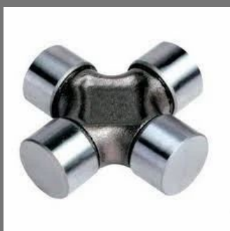
Universal Joint Cross for Precision Component Industry