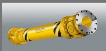
Drive Shaft Components