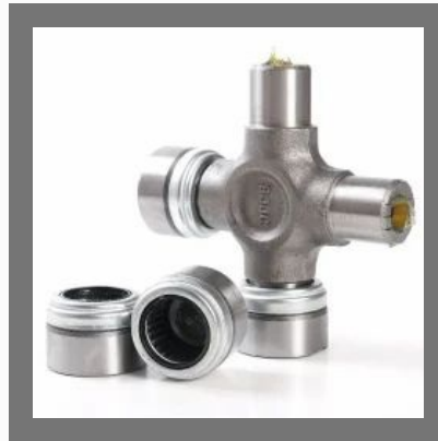
Precision Universal Joint Cross