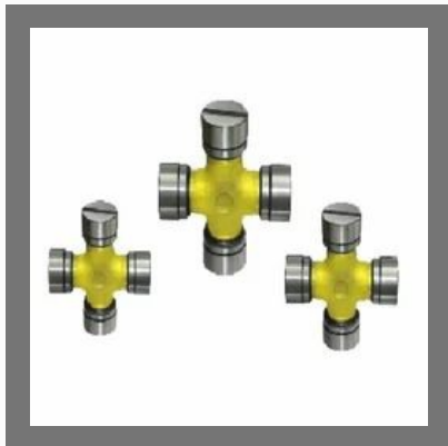
Universal Joint Cross