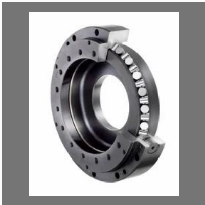
Crossed Roller Bearings