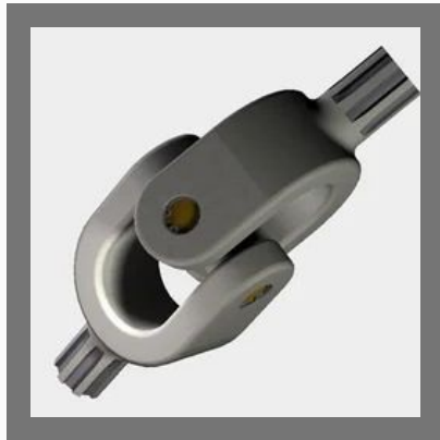
Automotive Universal Joint Cross