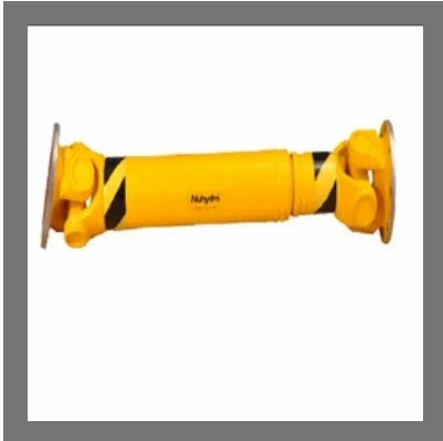
Nuhydro Cardan Shafts