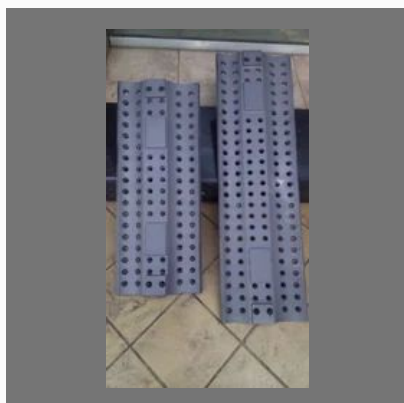
Manganese Steel Casting