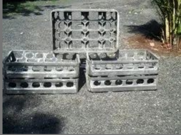
Heat Treatment Trays / Rails / Rollers and Fixtures.