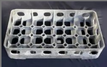
Heat Resistant Castings Tray