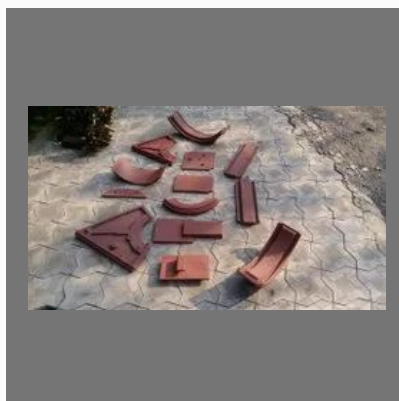
Shot Blasting Machines Spare Parts