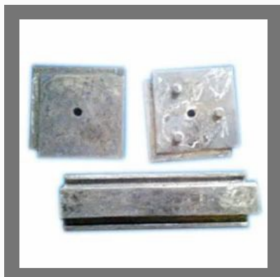
Manganese Spare Parts