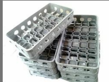
Heat Treatment Base Tray