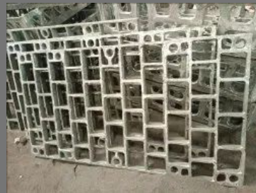
Heat Treatment Tray