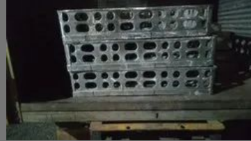
HN Grade Heat Treatment Tray