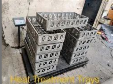
HK Grade Heat Treatment Trays