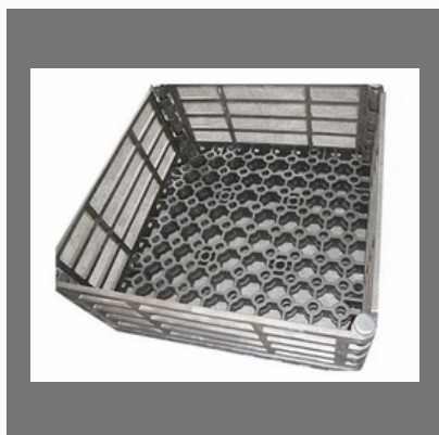
Heat Treatment Fixtures