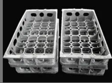
Heat Treatment Tray