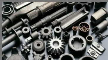
Cold Forged Components