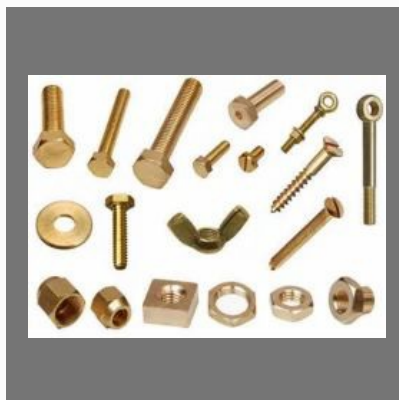
Brass Fasteners Screw