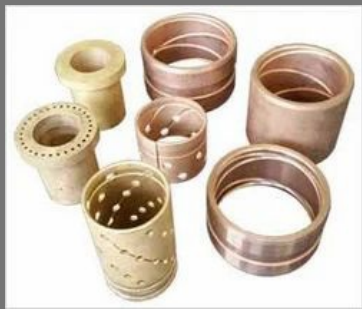
Brass Bushes For JCB's