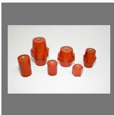
DMC / SMC insulator / Busbar