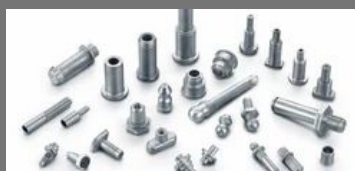
Cold Forging Parts