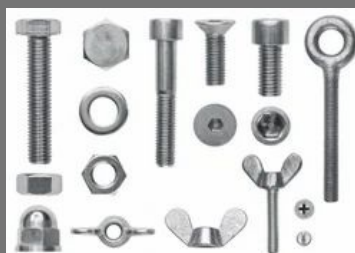
Metal Forged Part