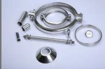
Press Parts Components