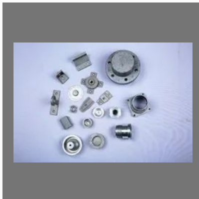
Aluminium Die Casting and Forging