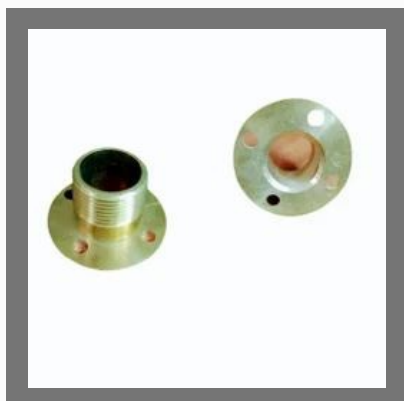
Brass Flanges For Water Solar Industry