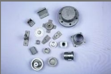
Aluminum Forging And Casting