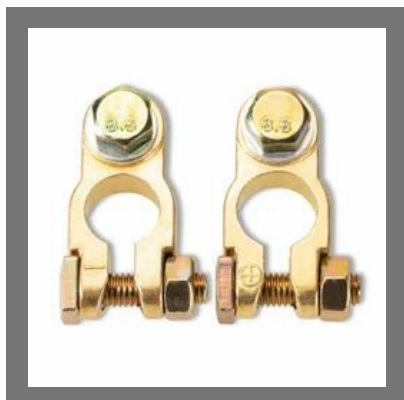
Battery Terminal Clamps