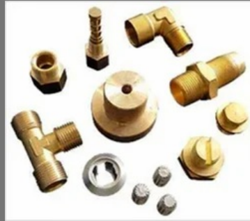
Precision Brass & Stainless Steel Turning Parts