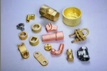
Brass And Copper Forging And Casting