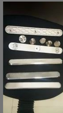
Stainless Steel Tactile Stud