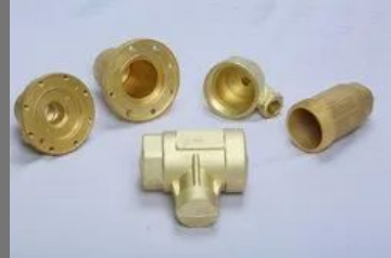
Brass, Copper and Aluminum Forging and Casting