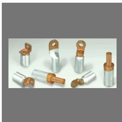
Bimetallic Cable Lug