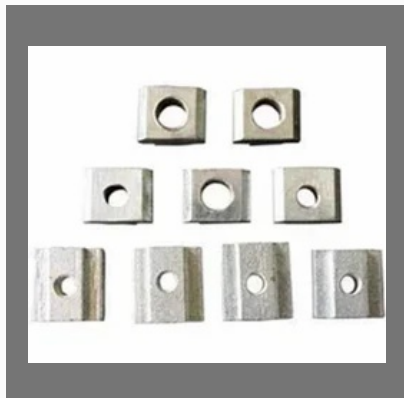
Steel T Nuts