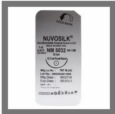
Nuvosilk NM 5032