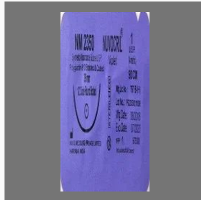
Nuvocril NM 2350