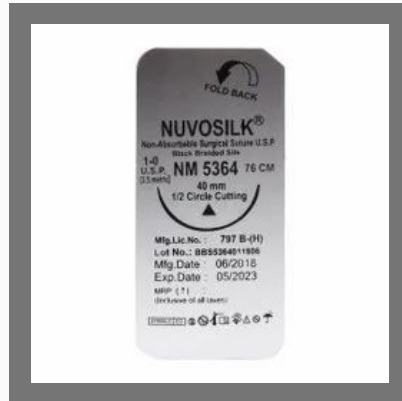
Nuvosilk NM 5364