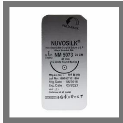
Nuvosilk NM 5073