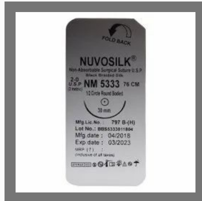
Nuvosilk NM 5333