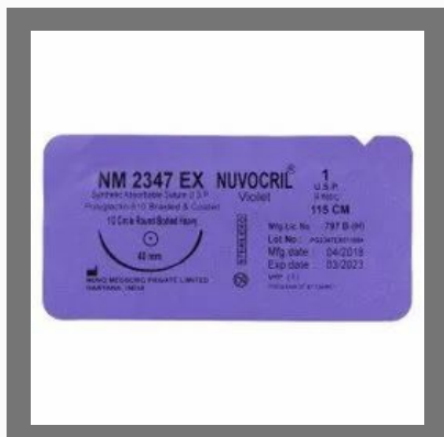
Nuvocril NM 2347 EX