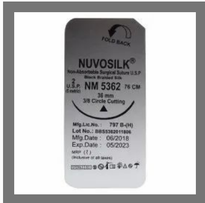
Nuvosilk NM 5362