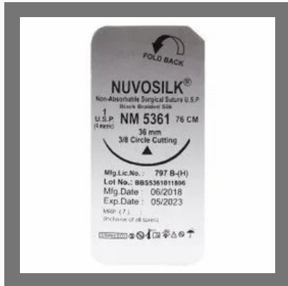
Nuvosilk NM 5361