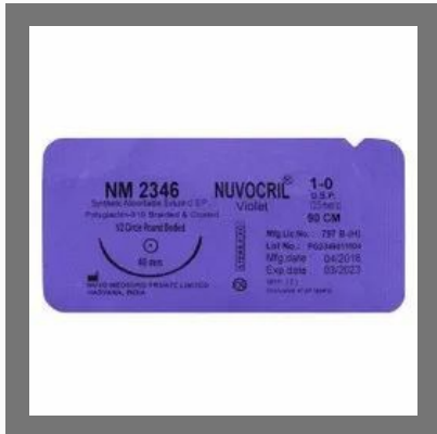
Nuvocril NM 2346