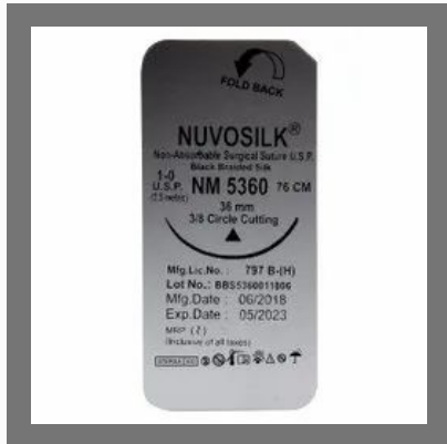
Nuvosilk NM 5360