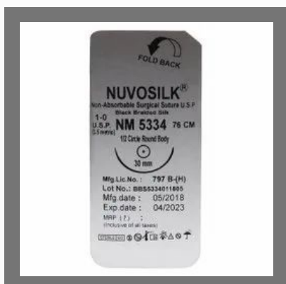
Nuvosilk NM 5334