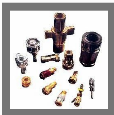
Hydraulic and Pneumatic Hoses