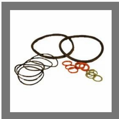
Hydraulic and Pneumatic Seals