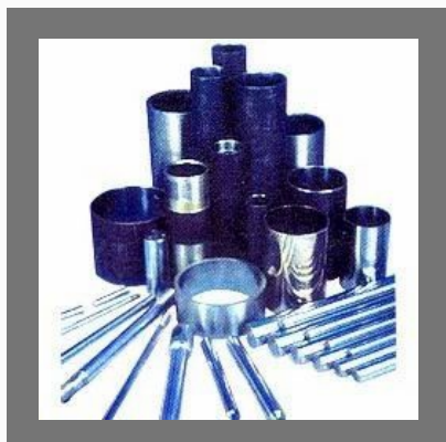
Hydraulic and Pneumatic Cylinders