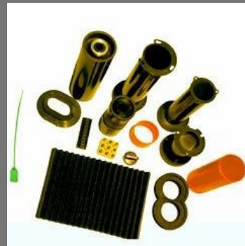
Allied Rubber Products