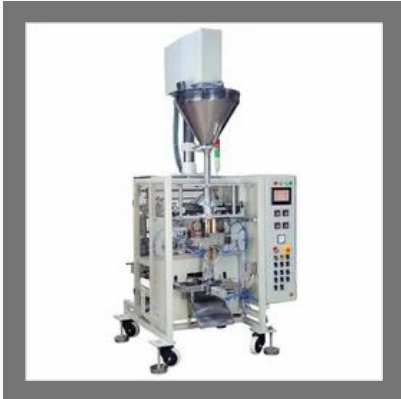
Granules Packaging Machine