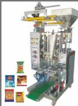
Half Pneumatic Machine