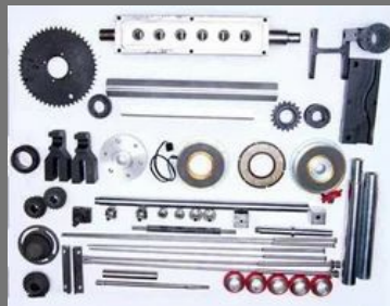
Packaging Machine Spare Parts