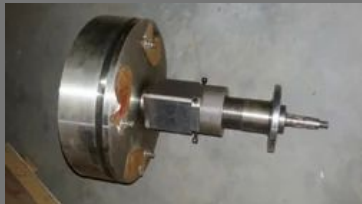
Discs for Adjustable Wait