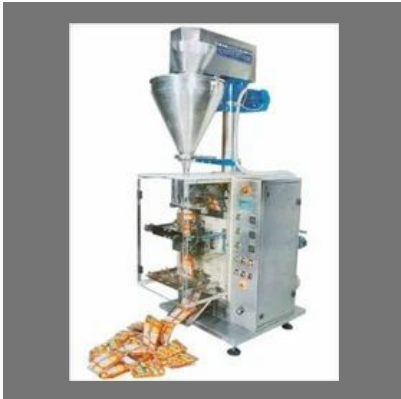
Auger Filler Collar Type Packing Machine