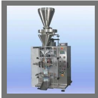
Detergent Powder Pouch Packing Machine