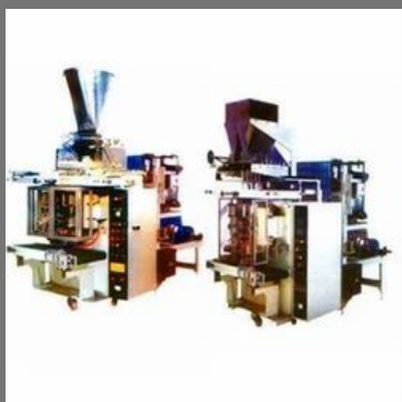
Packing & Sealing Machine