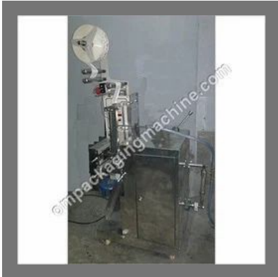
Hand Wash Lotion Cream Liquid Sachet Packing Machine