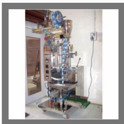
Pneumatic Form Fill Seal Machine for liquid