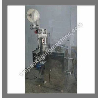
F.F.S. Liquid Machines Mechanical