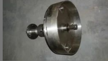
Discs For Powder