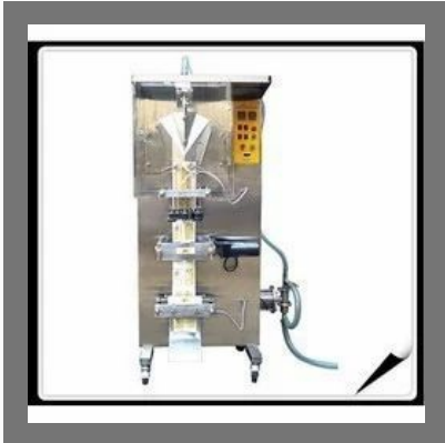
Liquid Filling Machine