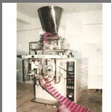
Multitrack Pouch Packing Machine