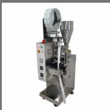
Three Side Sealing Machine