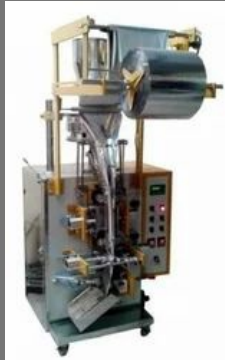
Pouch Packaging Machine