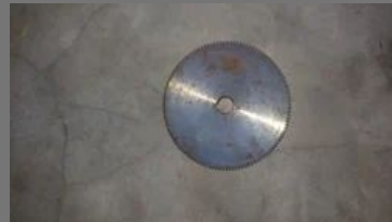
Pitch Gear 120 Teeth