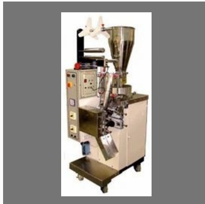
Four Side Sealing Machine