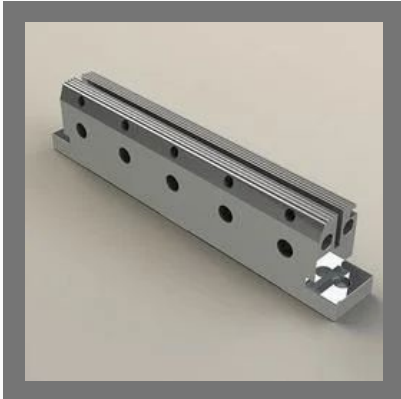
Sealer for Packaging Machine