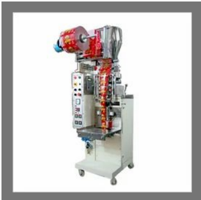
Pneumatic Sealing Machine