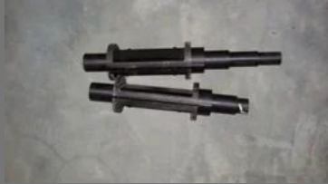
Horizontal Sealer Dia 51mm