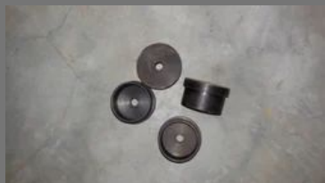
Dia Roller 58mm for FFS Machine