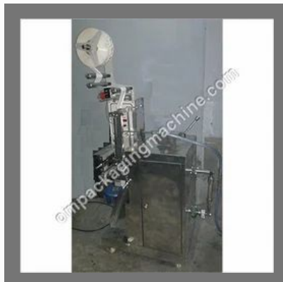
FFS Liquid Pouch Packing Machine