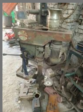
Pouch Packing Machine