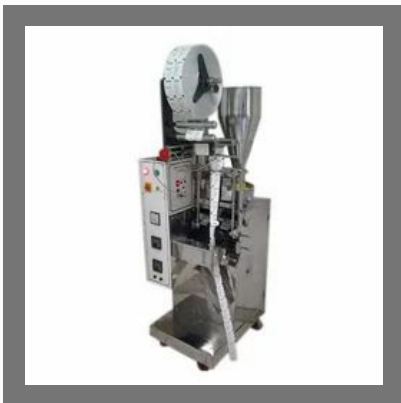
Pulses Packing Machine