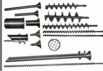
Auger Screw For FFS Machine