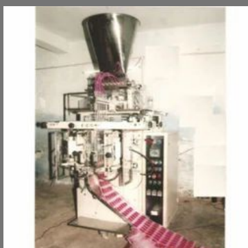
Sauce Pouch Packaging Machine