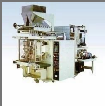
Automatic Powder Packing Machine