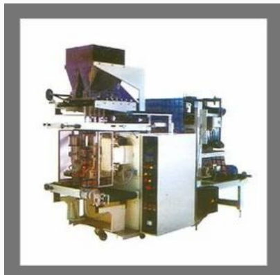
Automatic Free Flow Powder Multitrack Machines