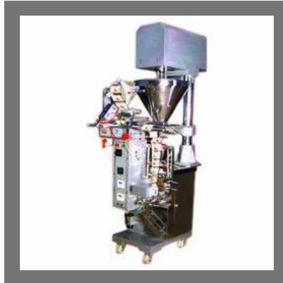
FFS Auger Filler Machine