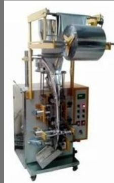
Besan Pouch Packing Machine