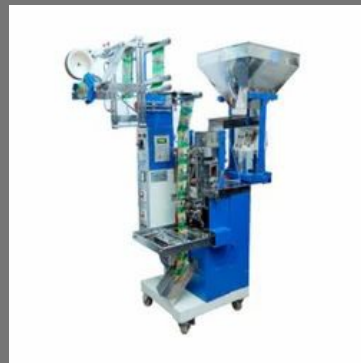
Pneumatic Form Fill Seal Machine