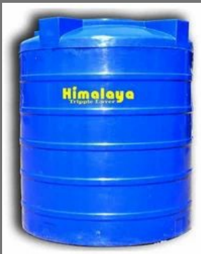
Himalaya 3 Layer Water Tanks