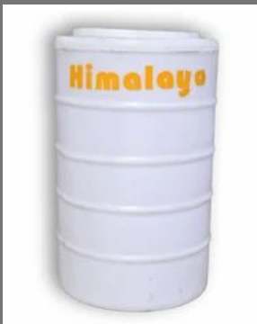
Surbhi Water Tanks