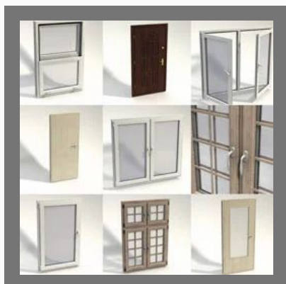
Doors And Windows