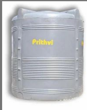
Prithvi 4 Layer Puff Tanks