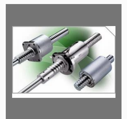
Hiwin Linear Motion Guide Ball Screw