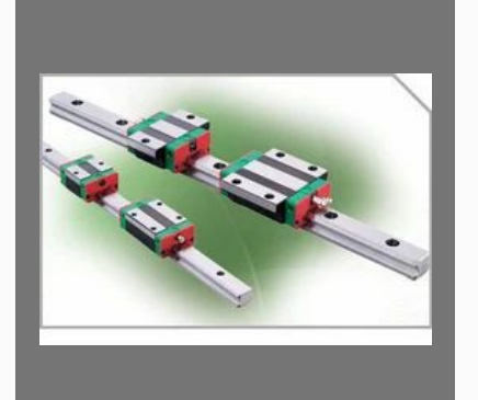
Linear Motion Guides Ball Screws

Linear Motion Guides,Ball Screws,Ball Screw Support Units,linear Soft,linear Motion Bearings