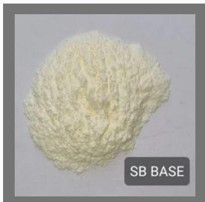
Salbutamol Sulphate Base