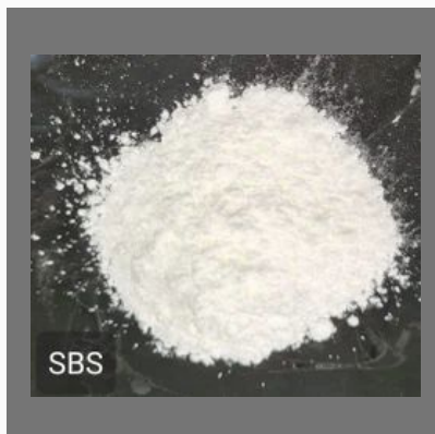
Salbutamol Sulphate EP