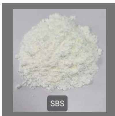
Salbutamol Sulphate IP