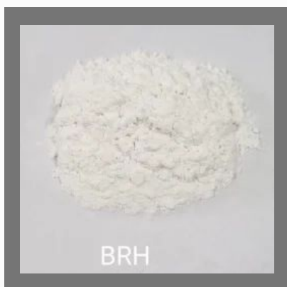
Bromhexine Hydrochloride IP