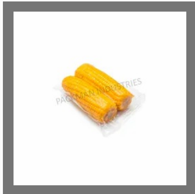
175 mm x 300 mm Vacuum Pouch (2000 Pcs)