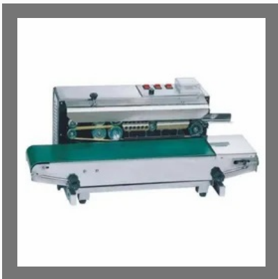
HORIZONTAL BAND SEALER MACHINE(Model 770)