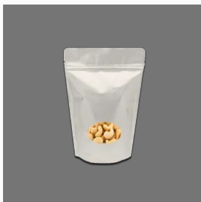
Shiny Color Standup Zipper Pouch With Oval Window(8x12)