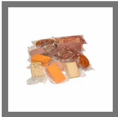
250 mm x 250 mm Vacuum Pouch (1700 Pcs)