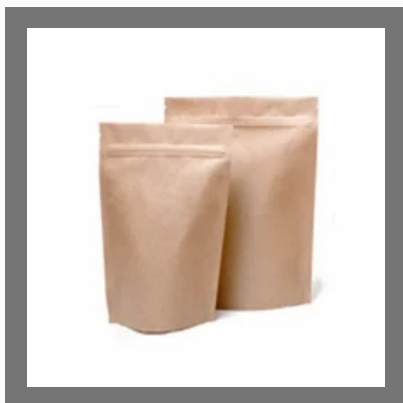
Kraft Paper Standup Zipper Pouch(4x7)