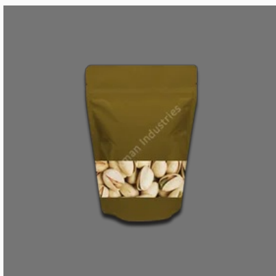
Matt Color Standup Zipper Pouch With Rectangular Window(5x8)