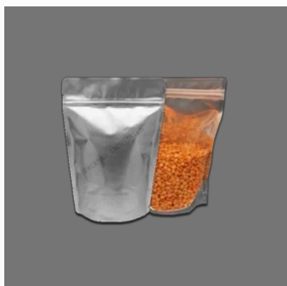
Silver/ Transparent Standup Zipper Pouch(5x8)