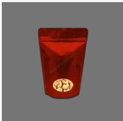
Shiny Color Standup Zipper Pouch With Oval Window(5x8)