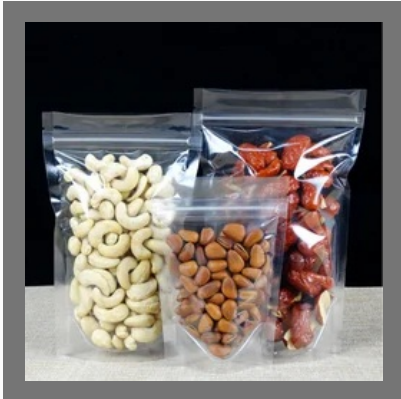
Transparent Standup Zipper Pouch (5x8)