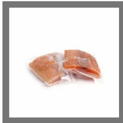
130 mm x 130 mm Vacuum Pouch (6500 Pcs)