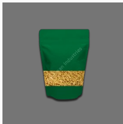
Matt Color Standup Zipper Pouch With Rectangular Window(6x9)