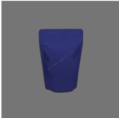
Both Side Matt Finish Standup Zipper Pouch (3.5x6)