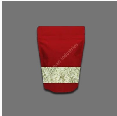
Matt Color Standup Zipper Pouch With Rectangular Window(4x7)