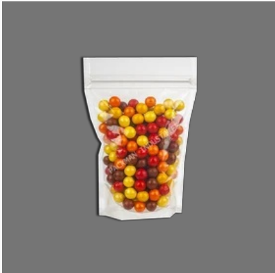
Transparent Standup Zipper Pouch (4x7)