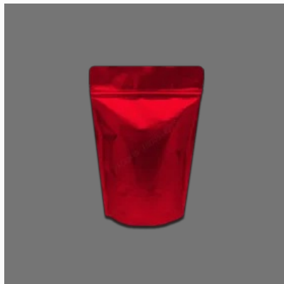
Both Side Shiny Standup Zipper Pouch(4x7)