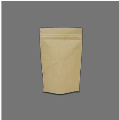
Kraft Stand Up Zipper Pouch