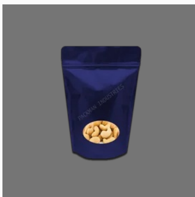
Shiny Color Standup Zipper Pouch With Oval Window(4x7)