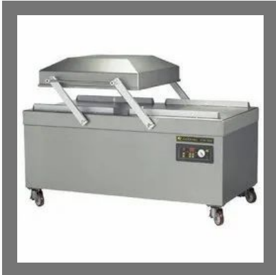
DOUBLE CHAMBER VACUUM PACKAGING MACHINE(600mm)