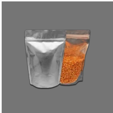
Silver/ Transparent Standup Zipper Pouch(4x7)