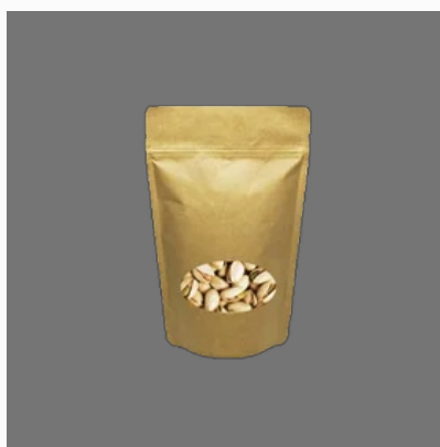
Kraft Paper Standup Zipper With Oval Pouch Window (4x7)