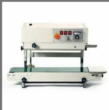
VERTICAL BAND SEALER MACHINE(770)