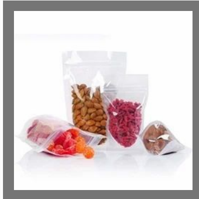
Transparent Standup Zipper Pouch (3.5x6)