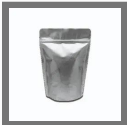
Both Side Shiny Silver Standup Zipper Pouch