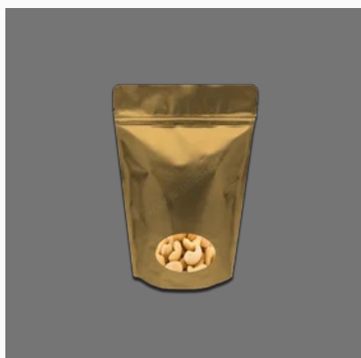
Shiny Color Standup Zipper Pouch With Oval Window(7x10)