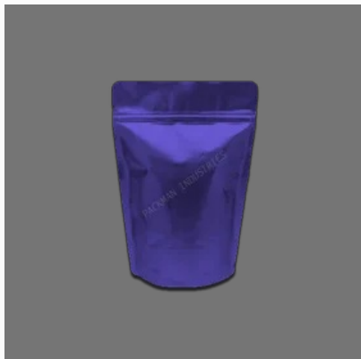
Both Side Shiny Standup Zipper Pouch(3.5x6)