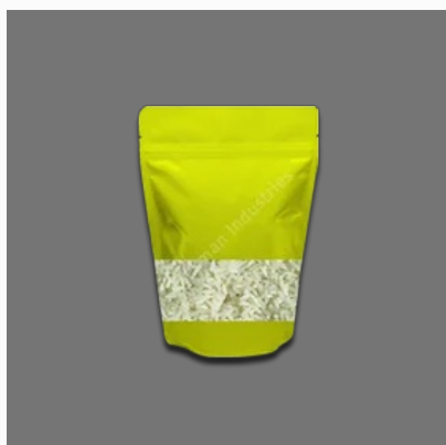
Matt Color Standup Zipper Pouch With Rectangular Window(7x10)