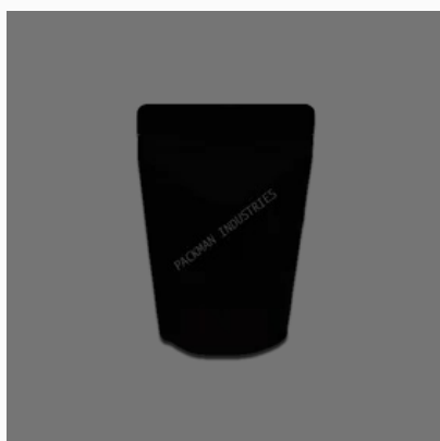
Both Side Shiny Standup Zipper Pouch(8x12)