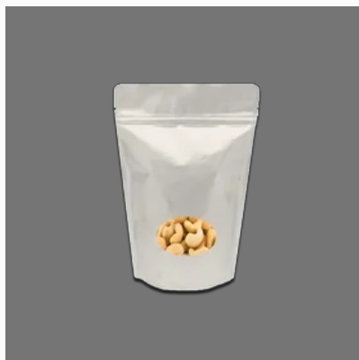
Both Side Shiny Stand Up Zipper Pouch