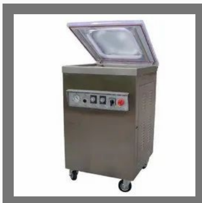
Single Chamber Vacuum Packaging Machine(400mm)