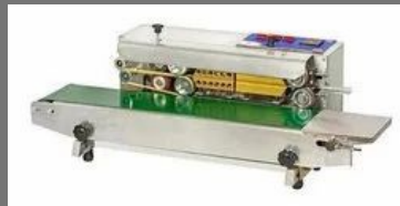
HORIZONTAL BAND SEALER MACHINE(Model 900)