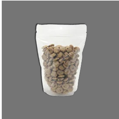
Transparent Standup Zipper Pouch (6x9)