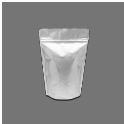
Both Side Shiny Standup Zipper Pouch(6x9)