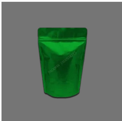
Both Side Shiny Standup Zipper Pouch(5x8)