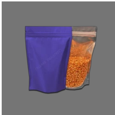
One Side Shiny/ One Side Transparent Standup Zipper Pouch