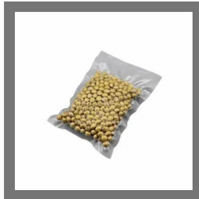
200 mm x 200 mm Vacuum Pouch (2700 Pcs)