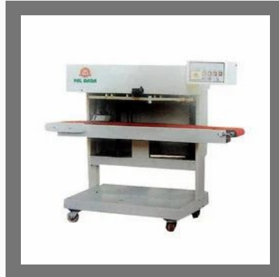
Vertical Band Machine