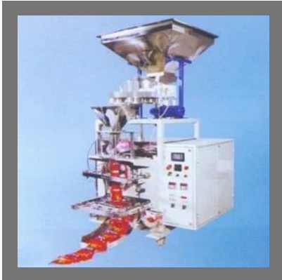
Pneumatic Collar Type Machine PLC Bases