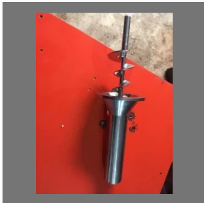
Pouch Packaging Auger Screw