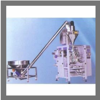
Pneumatic Collar Type Auger Filler PLC Bases