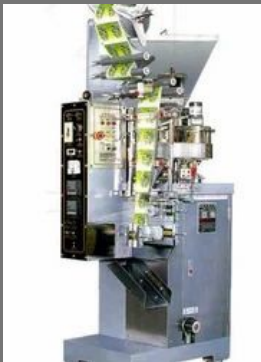
Powerful Packaging Machine