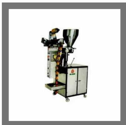
Intermittent Form Fill Seal Machine