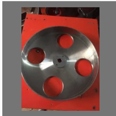
Pouch Packaging Machine Disc