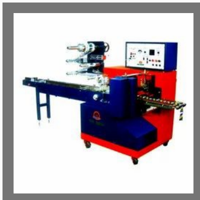
Horizontal Flow Wrap Machine