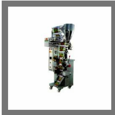
Automatic Form Fill Seal Machine