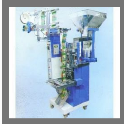
F.F.S Semi Pneumatic Machine