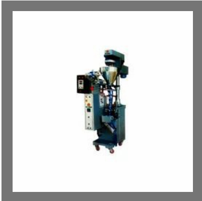
Auger Filler Machine