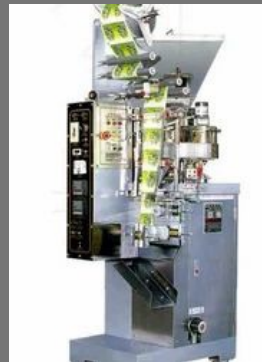
Guthka Packaging Machine