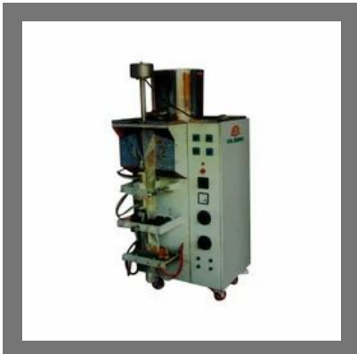
Liquid Fill Seal Machine