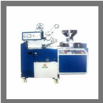
Candy Packaging Machine