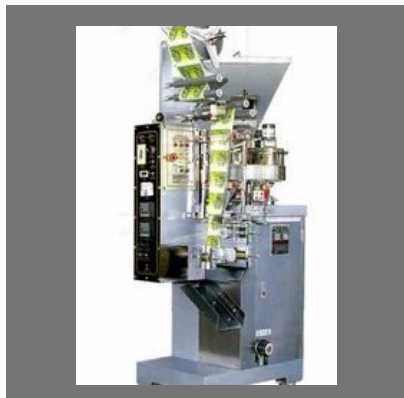
Rice Packaging Machine