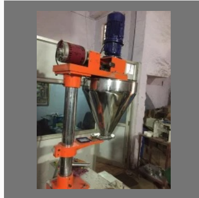
Auger Filler Machine