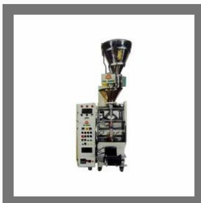
Auger Type Form Fill Seal Machine