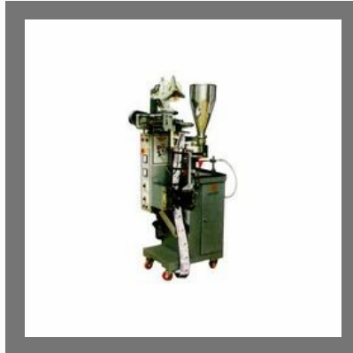
Form Fill Seal Machine