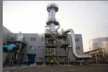
Zero Liquid Discharge Plant