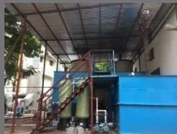
50 KLD Sewage Treatment Plant