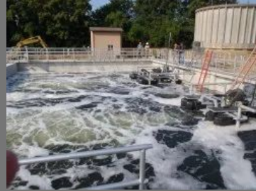
Sequential Batch Reactor