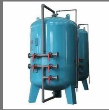
MS Pressure Sand Filter