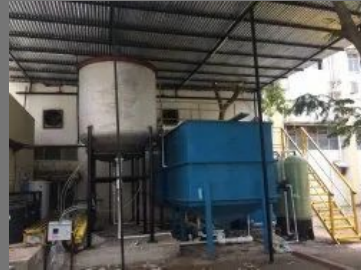
20 KLD Effluent Treatment Plant