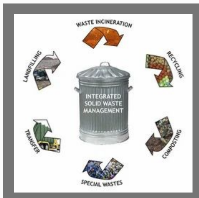
Solid Waste Management Services