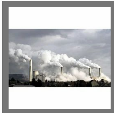
Pollution Control Consultation Services