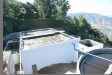
Effluent Treatment System