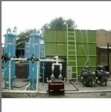
Domestic Sewage Treatment Plant