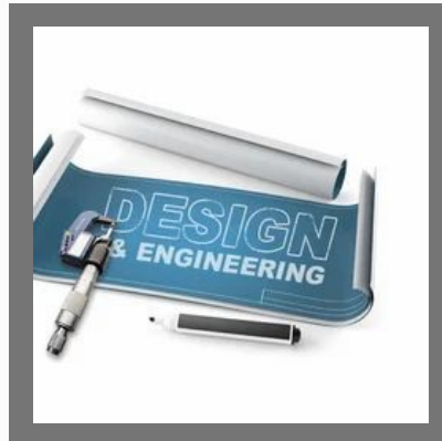
Environmental Engineering Consultants