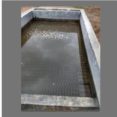
Dairy Effluent Treatment Plant