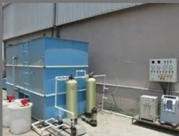
Prefabricated Sewage Treatment Plant