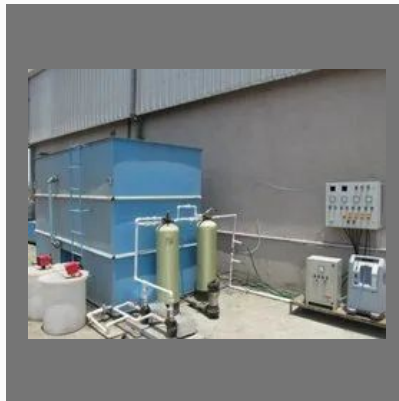
Effluent Treatment & Wastewater Treatment Plant