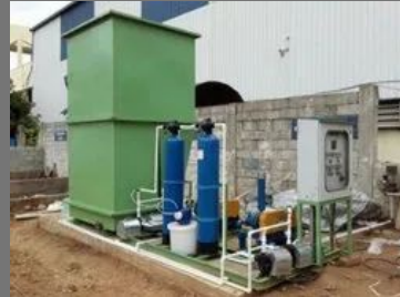
20 Kld Sewage Treatment Plant