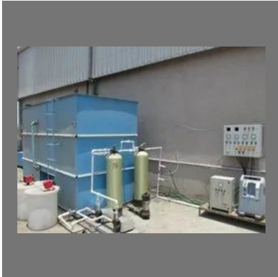
Packaged Wastewater Treatment Plant