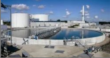
50 KLD Effluent Treatment Plant