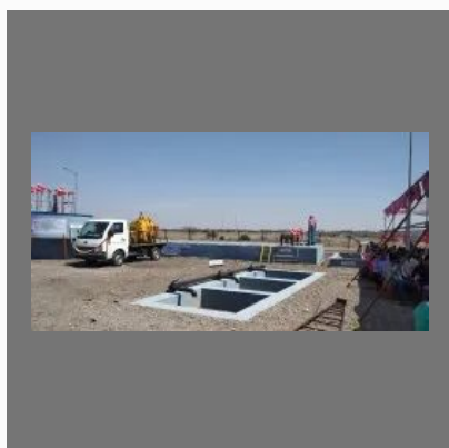
Anaerobic Treatment Plant