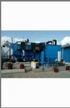
Sewage Treatment Plant Service