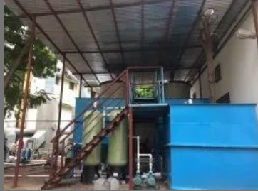
Industrial Waste Water Treatment Plant