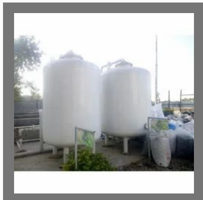
Pressure Sand Filter