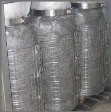
Sludge Treatment Plant