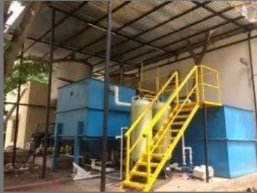
Industrial Sewage Treatment Plant