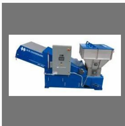
Sludge Dewatering System