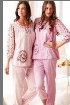
Pajama Design Service