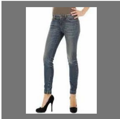
Women Denims Design Service