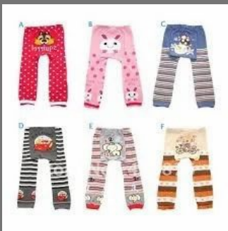
Leggings Design Service