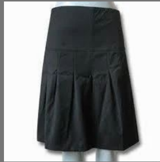
Skirts Design Service