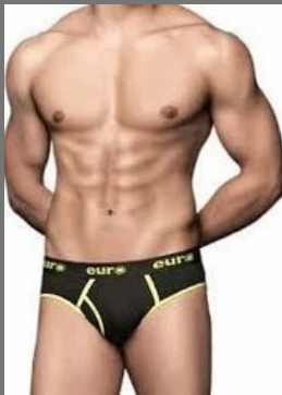
Inner Wear Design Service