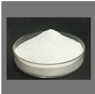
Amorphous Aluminum Hydroxide