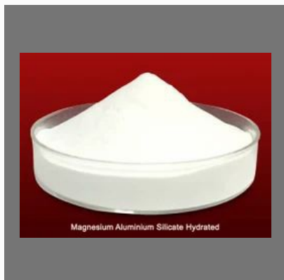
Magnesium Aluminum Silicate Hydrated