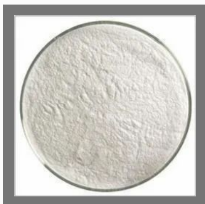
Synthetic Sodium Aluminum Silicate