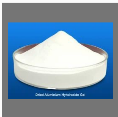
Dried Aluminum Hydroxide Gel IP/BP/USP