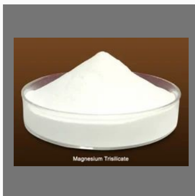
Magnesium Trisilicate IP/BP/USP