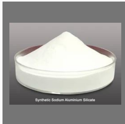
Synthetic Sodium Aluminum Silicate