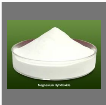
Magnesium Hydroxide IP/BP/USP