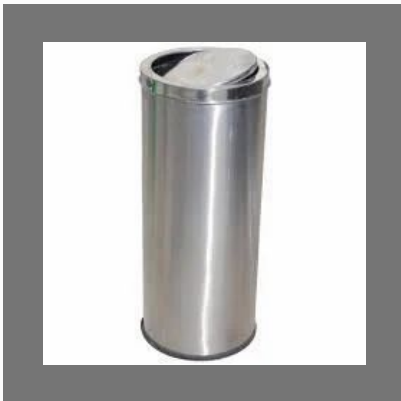
Steel Dust Bin