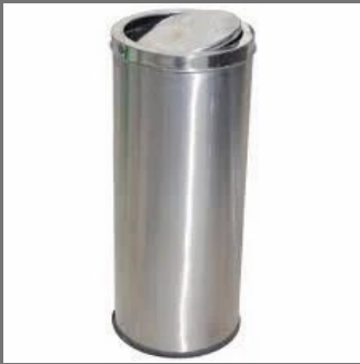
Stainless Steel Dustbin