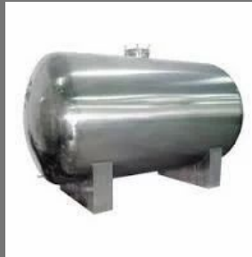
Stainless Steel Tanks