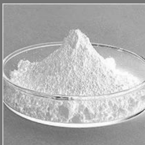
Sodium Meta Per Iodate