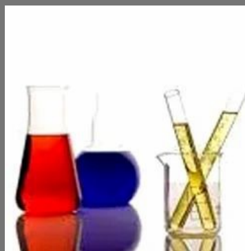
Tri Methyl Sulphoxonium Iodide