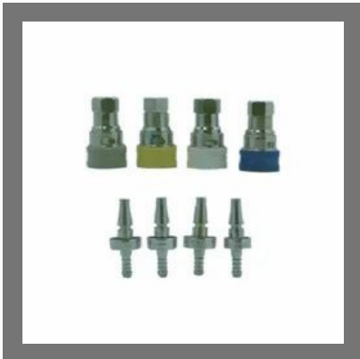
Self Sealing Valves