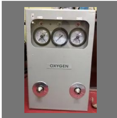
Semi Automatic Control Panel