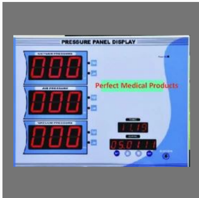
Multi Gas Alarm (DIGITAL)