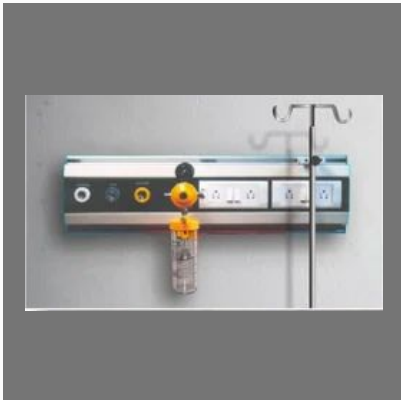
Bed Head Panel (single)