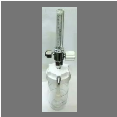
Metal BPC Flow Meters