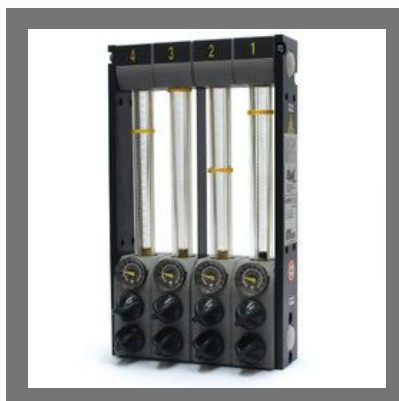
Water Flow Regulator