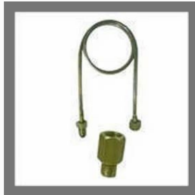
Tailpipe With Non Return Valve