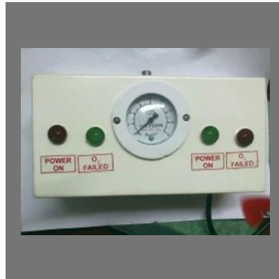
Single Gas Alarm ( Economical Model )