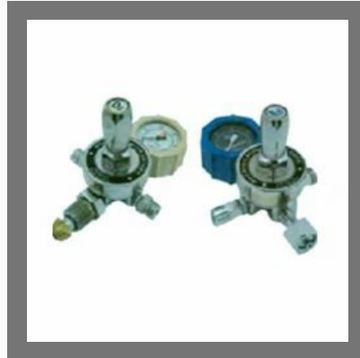
Nitrous Oxide Regulators