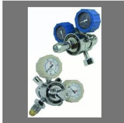
Double Stage Regulator