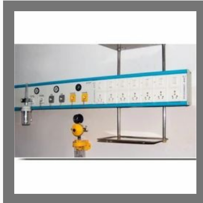
Bed Head Panel (Multy)