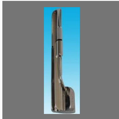
Laryngoscope Miller Blade