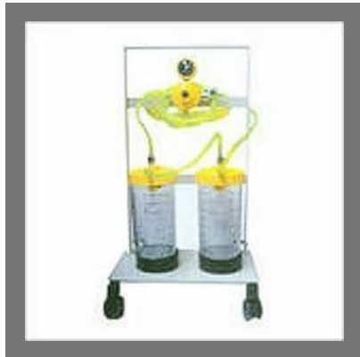
Theater Suction Unit