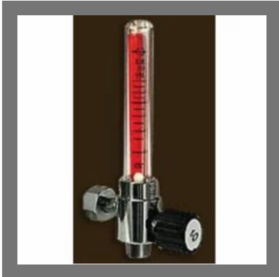
Pediatric Flow meter