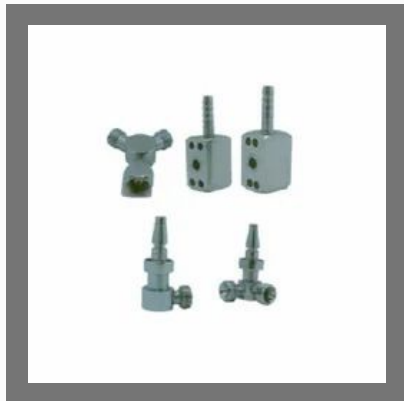
Single & Twin Pipe Line Adapters