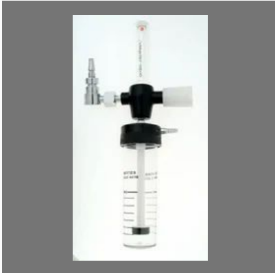
Plastic BPC Flow Meter