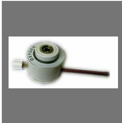
Medical Gas Outlet(Sigma)