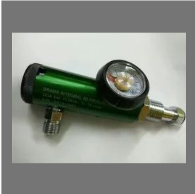
Flow Regulator for B- Type Cylinder