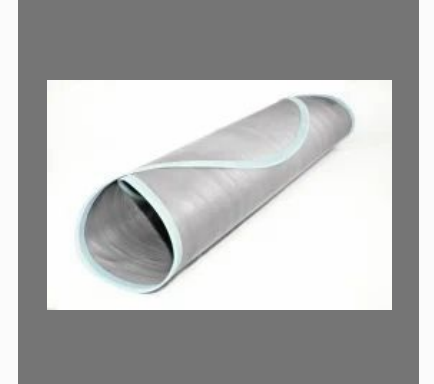
Lead Free Silicone Moulded FBD, FBE & FBP Sieves