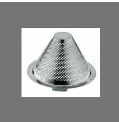
Lead Free Co- Mill Sieves