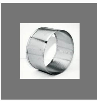
Lead Free Multimill Sieves