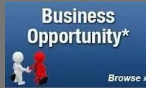
PCD Pharma Franchise in Bihar