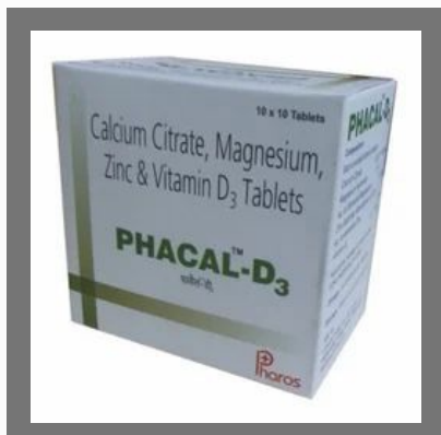
Calcium Citrate Magnesium Zinc And Vitamin D3 Tablets