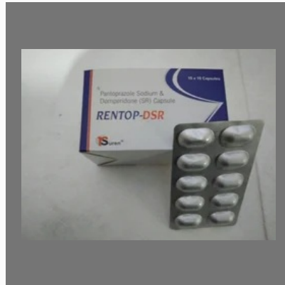
RENTOP DSR Tablet