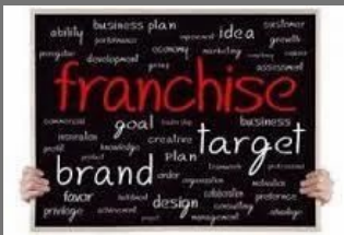
PCD Pharma Franchise in Karnatka