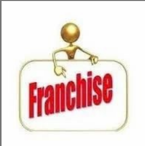
PCD Pharma Franchise in Punjab