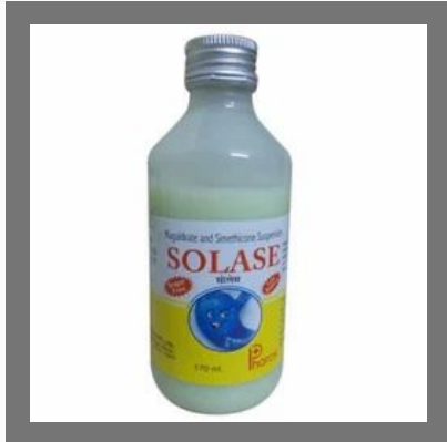
Magaldrate And Simethicone Syrup