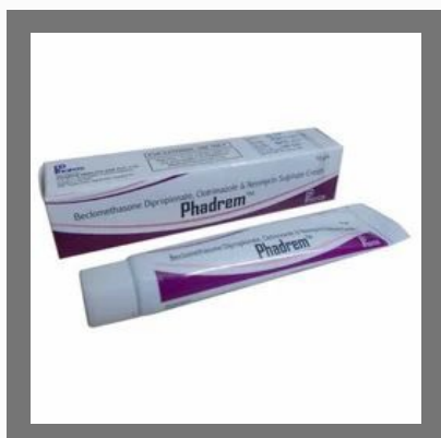
Phadrem Skin Ointment