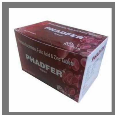
Ferrous Ascorbate Folic Acid And Zinc Tablet