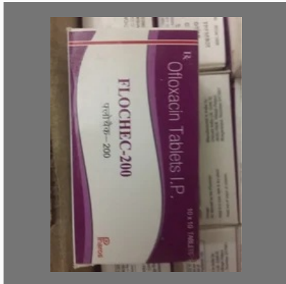
Cefixime Dispersible Tablet