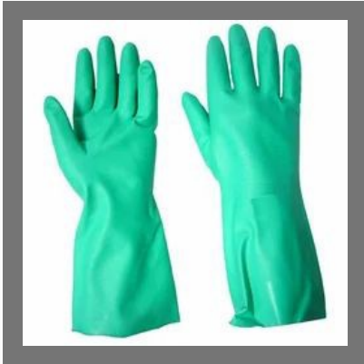
Chemical Resistant Gloves