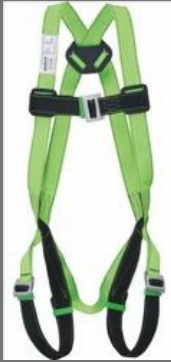
Full Body Harness with Single & Double Lanyard