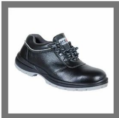
Blacksteel Buff Printed Leather Shoes