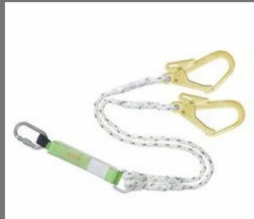
Shock Absorbing Double Lanyard with Scaffolding Hook