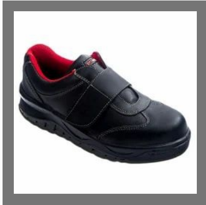
Women Shoes LS.03