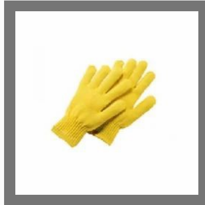
Cotton Drill Gloves