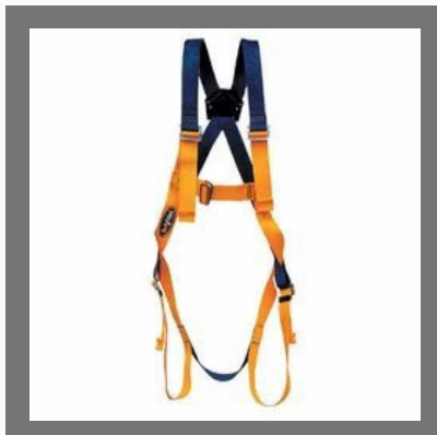
Fall Protection Equipment