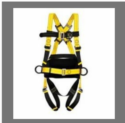
Oil & Dust Repellant - Revolta Range