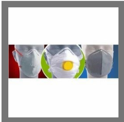
Filtering Facepiece Respirator