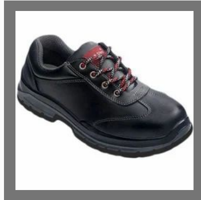
Premium BS.9021 Safety Shoe