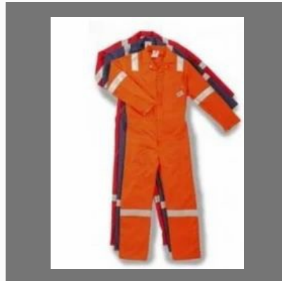
Nomex IIIA Garments