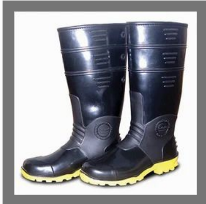
Rubber Snow Ankle Button Boot