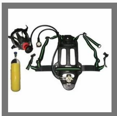
Self Contained Breathing Apparatus