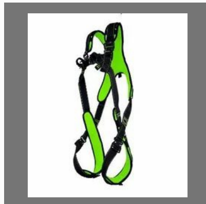
Karam Magna 1 Harness