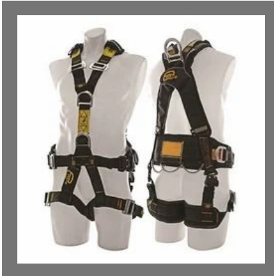
Full Body Safety Harness