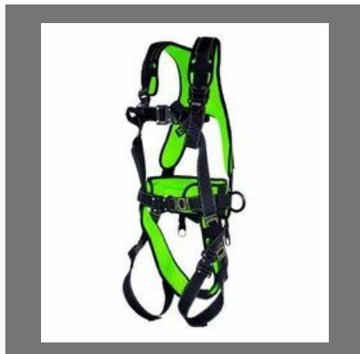
Karam Magna 2