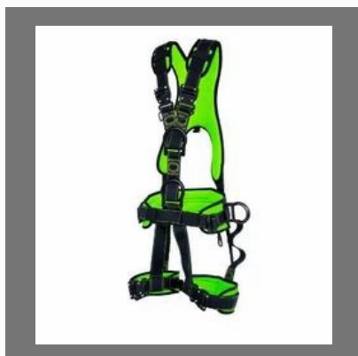
Karam Magna 3 Harnesses