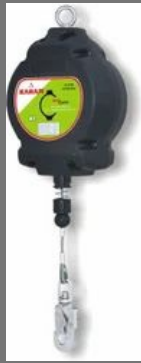
Retractable Fall Arrestor Systems