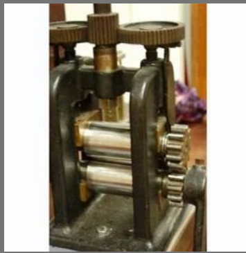
Rolling Mill Parts