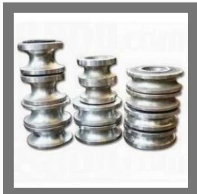
Tube Mill Parts