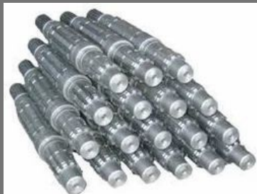
Forged Sugar Mill Shafts