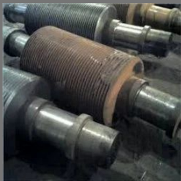
Sugar Plant Rollers