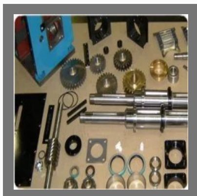
Tube Mill Spares Parts