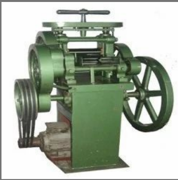
Roll Body Roller Mill Machine