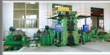
High Precision Cold Rolling Mill Machine