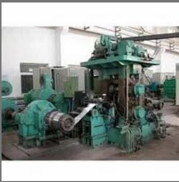
Cold Rolling Mill Machine