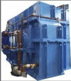
Pinion Stand for Rolling Mills