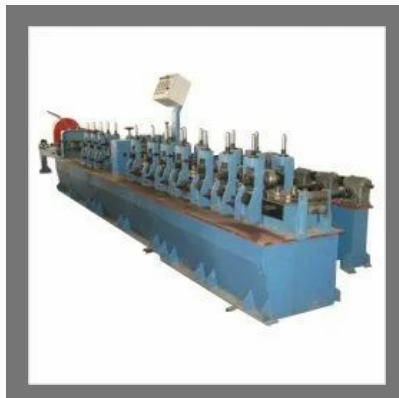
Tube Mill Machine