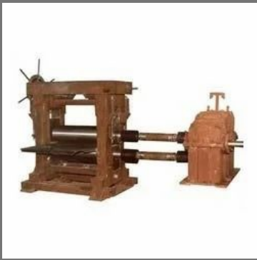
Hot Rolling Mill Machine