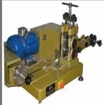
Flat Rolling Mill Machine