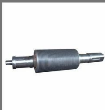
Sugar Mill Roller