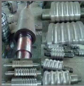
Hot Rolling Mill Equipment