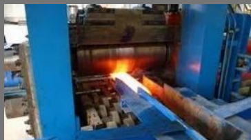
Hot Rolling Mill Machine