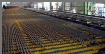
TMT Cooling Bed