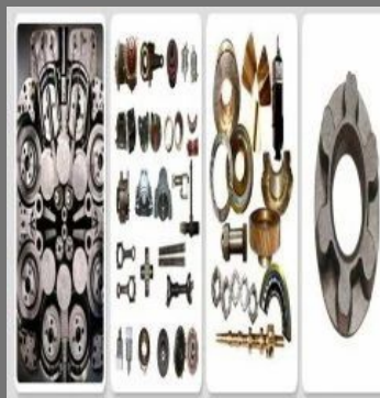
Sugar Mill Machinery Parts