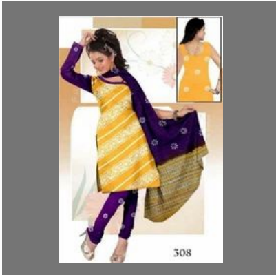
Printed Churidar Suits