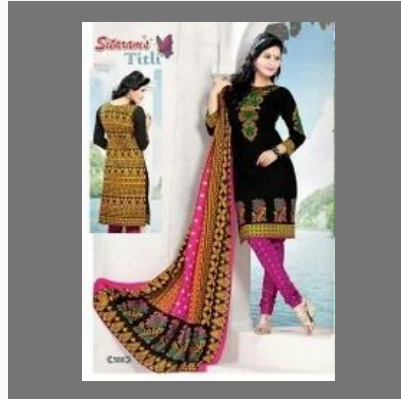
Printed Churidar Suits