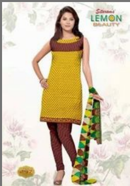
Printed Cotton Unstitched Suits