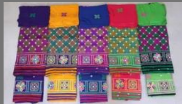
Satin Rajvadi Salvar Work Dupatta Work.