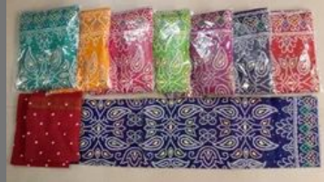
Katha Hand Work Unstitched Suits