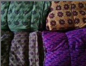
Printed Cotton Satin Unstitched Suits