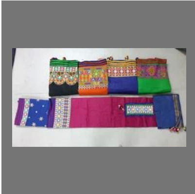
Satin Rajvadi Tai Border Salvar Work Dupatta Fumka