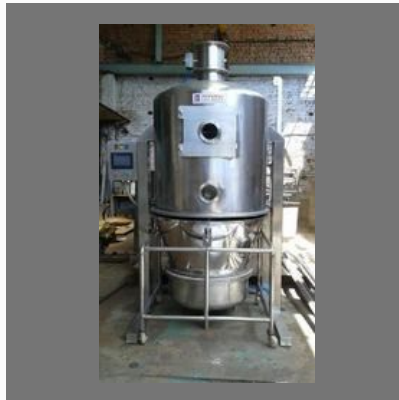
Fluid Bed Dryer CGMP