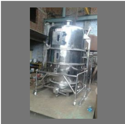
Fluid Bed Dryer.