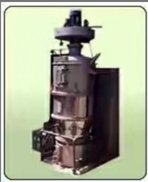
FLUID BED DRYER