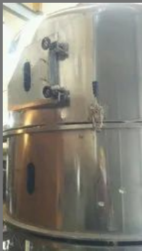
Fluid Bed Dryer