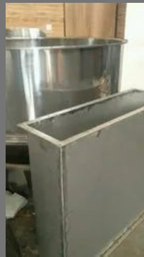
SS Machinery Parts