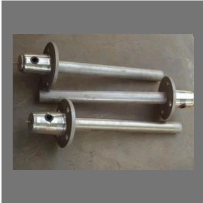
Industrial Electrical Heaters