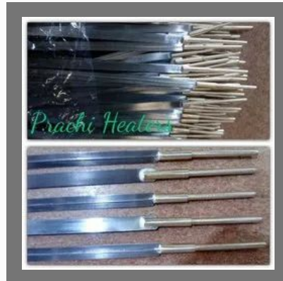
T Type Flat Electrodes