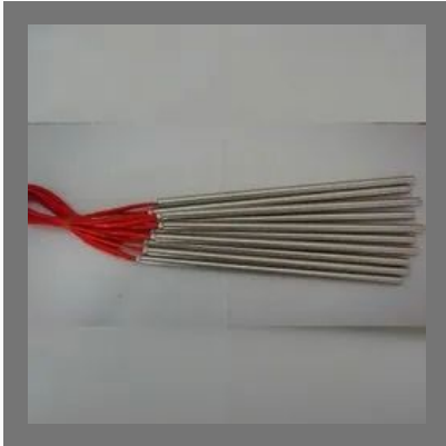
High Density Cartridge Heaters