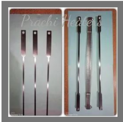
Vertical Sealing Electrodes