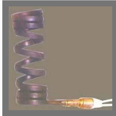
Micro Coil Heaters