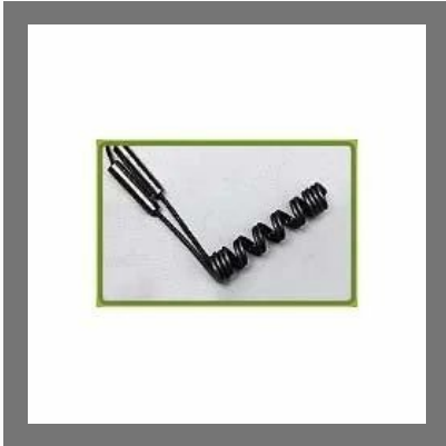
Micro Tubular Coil Heaters