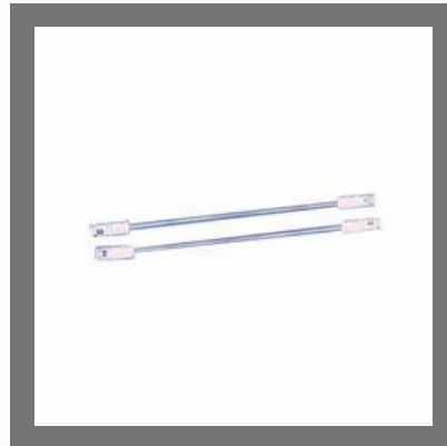
Quartz Infrared Heater