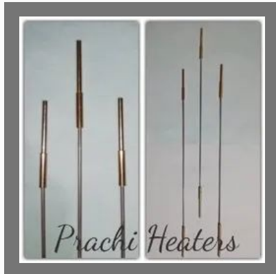
Horizontal Round Electrodes