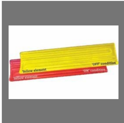
Ceramic Infrared Heater