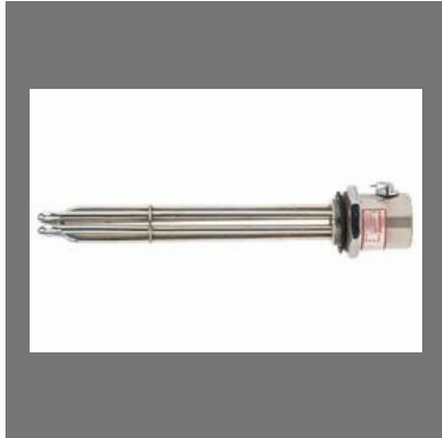
Air Heating Heaters