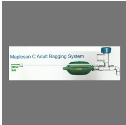
Closed Suction System