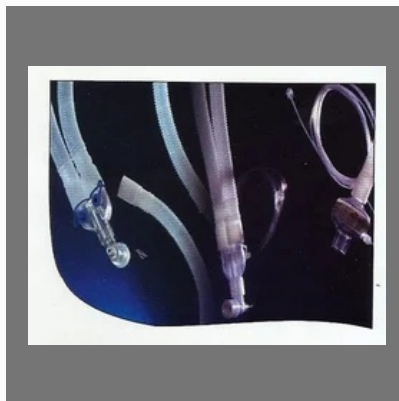
Ventilator Circuit With Double Water Trap