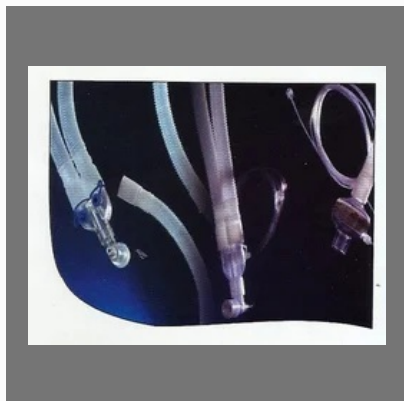
Ventilator Circuit With Single Water Trap