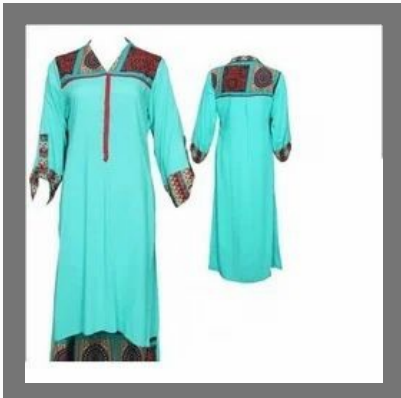
Ladies Designer Long Kurti