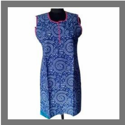
Printed Short Kurti