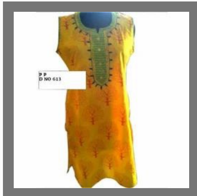
Ladies Hand Block Print Kurti