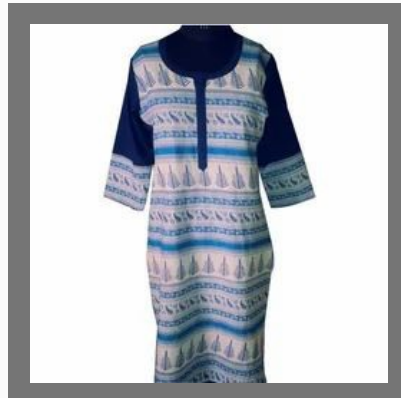
Ladies Fashionable Long Kurti