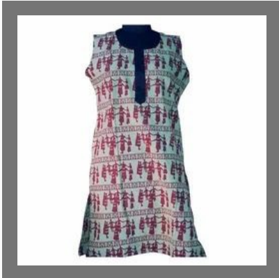
Cotton Short Kurti