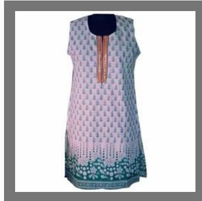
Ladies Short Kurti