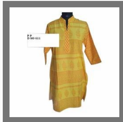
Ladies Block Print Kurti