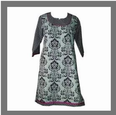
Ladies Block Print Kurti