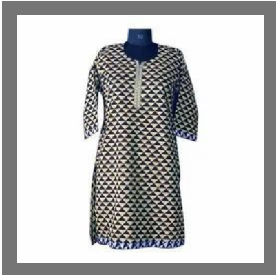
Ladies Long Sleeve Short Kurti