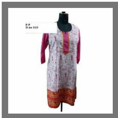
Ladies Straight Kurti