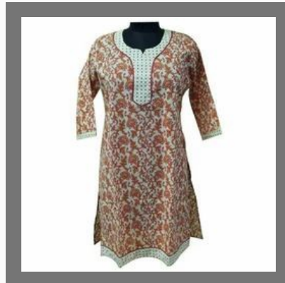
Ladies Flower Print Kurti