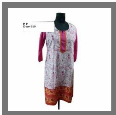
Ladies Print Kurti