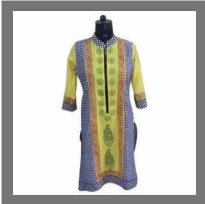
Ladies Cotton Long Kurti