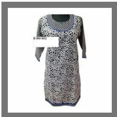
Cotton Print Kurti