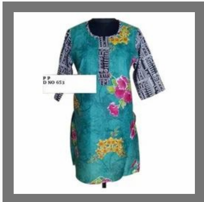
Flowra Digital Printed Kurti