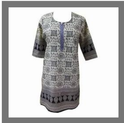
Printed Long Straight Kurti