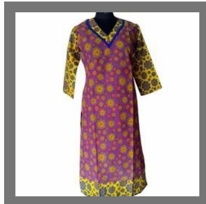
Flower Print Kurti