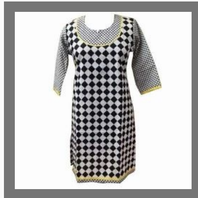
Cotton Straight Kurti