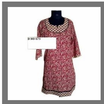
Multiple Flower Printed Kurtie