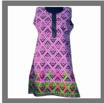
Ladies Designer Short Kurti