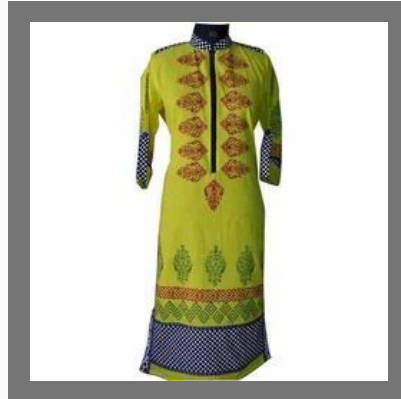
Ladies Long Kurti