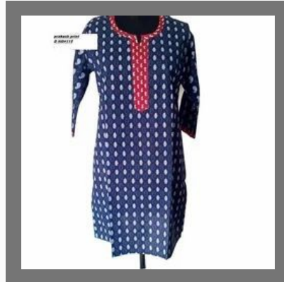
Ladies Cotton Straight Kurti