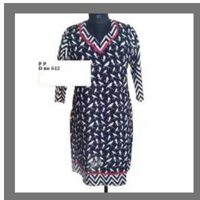
Ladies Printed Long Straight Kurti