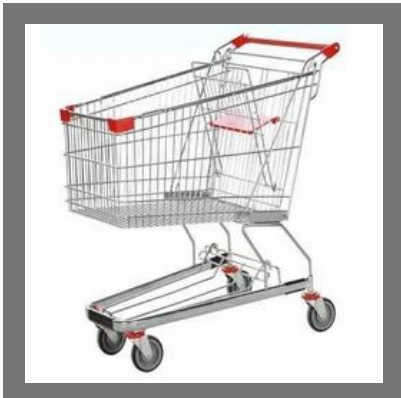
Departmental Store Trolley