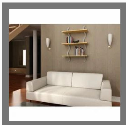
Wave Shelves Kit