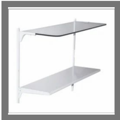
Single Slot System