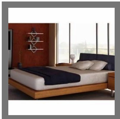
Diamond Shelves Kit