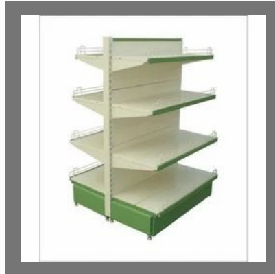
Hypermarket Gondola Racks