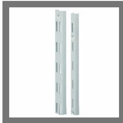
Single Slot Channel/Single Double Slot Channel