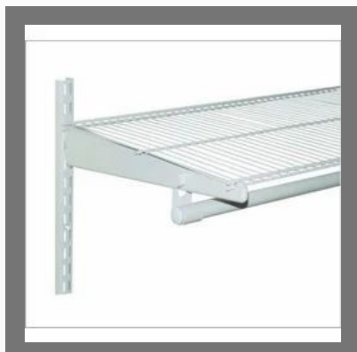
Ventilated Wire Shelf