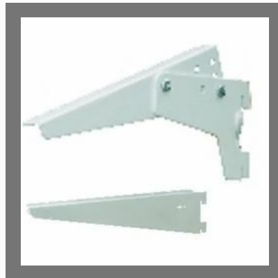
Angle Bracket and L-Type Bracket