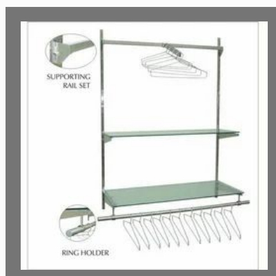
Supporting Rail Set/Ring Holder