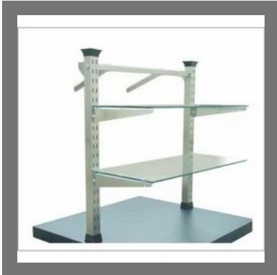
SS Center Gondola