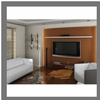
Lava Shelves Kit