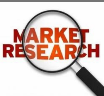
Market Study Service