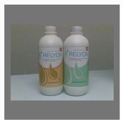
Halo Acetic Acids