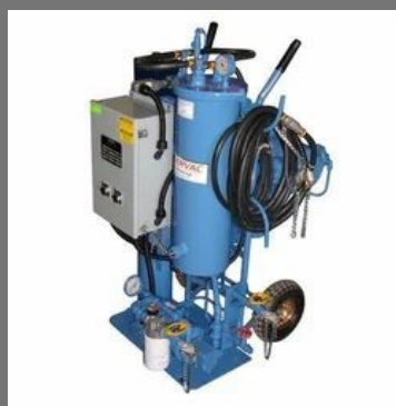
Portable Oil Purification System