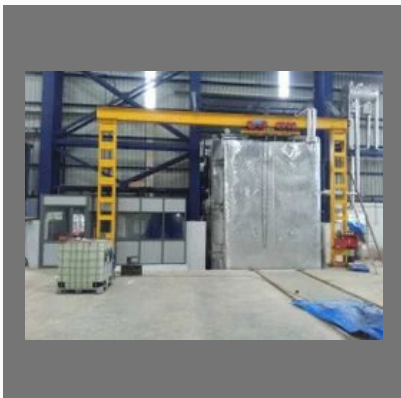
Vapor Phase Drying Plant