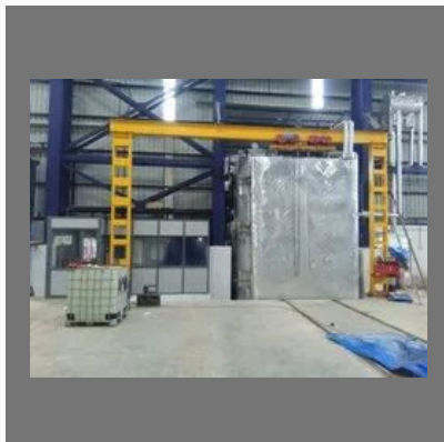
Vapor Phase Drying Plant