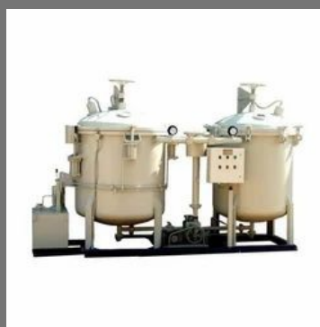
Vacuum Impregnation Plant