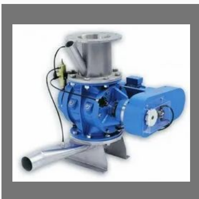
Rotary Air Lock Valve