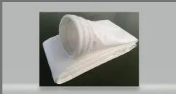
Dust Collector Filter Bags