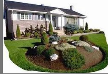
Designing And Landscaping Services