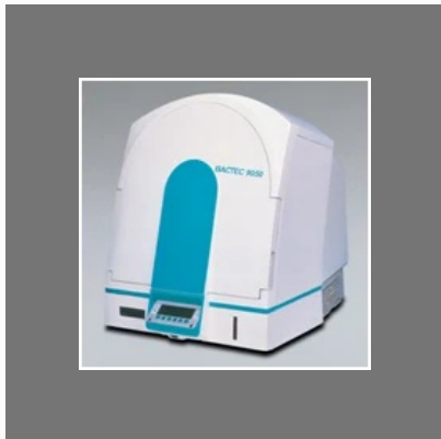
Blood Culture Systems