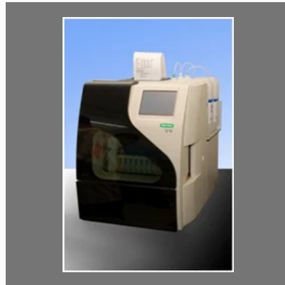
Liquid Chromatography Systems