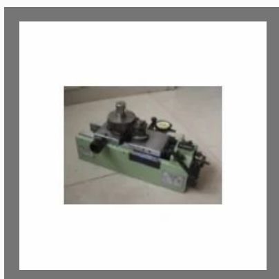
Special Purpose Machines