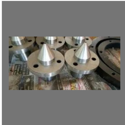
Cnc Turned Component