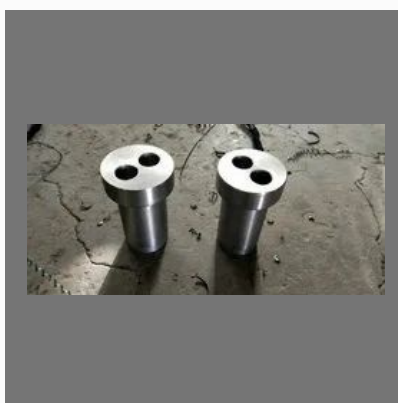
CNC Tool parts