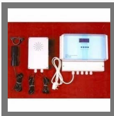
Chlorine Gas Leak Detector