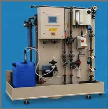
Chlorine Dioxide Generation System