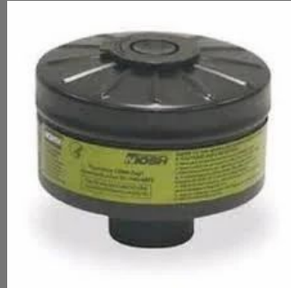
Canister Gas Mask