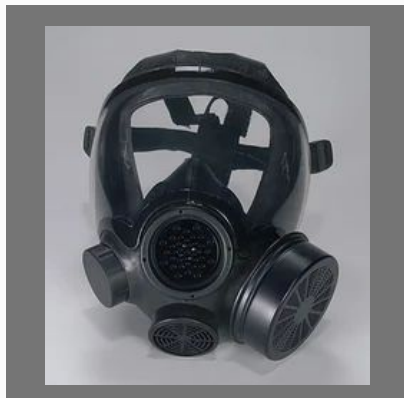
Canister Gas Mask