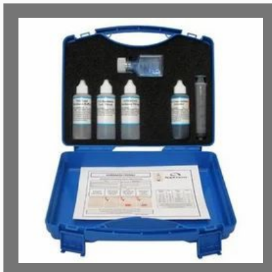
Chlorine Test Kit