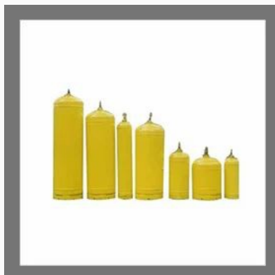
Chlorine Gas Cylinder