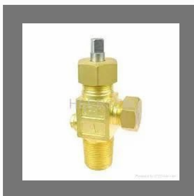
Liquid Chlorine Cylinder Valve