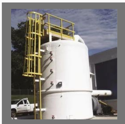
Chlorine Leak Absorption System