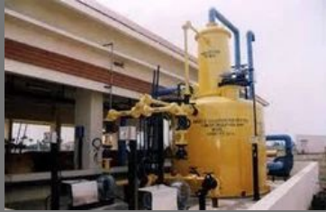
Chlorine Leak Absorption System