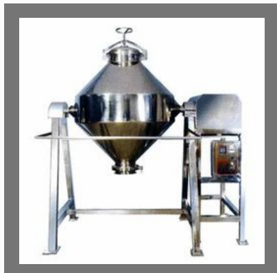
Double Cone Blender