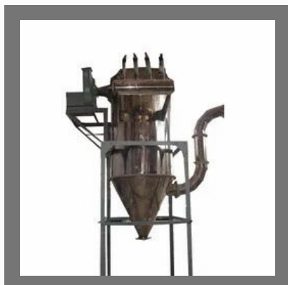
Pulse Jet Dust Collectors