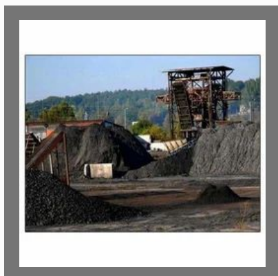
Coal Handling Plant