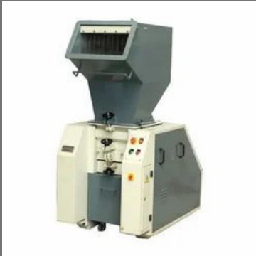
Plastic Waste Grinder