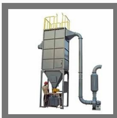
Dust Collector System