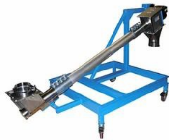
Flexible Screw Conveyor