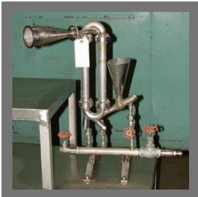
Fluid Energy Mill