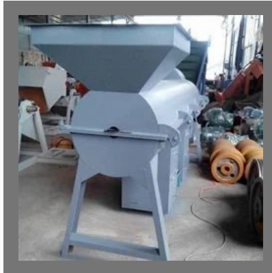
Plastic Label Remover