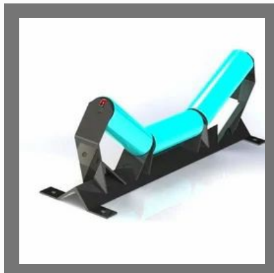
V Belt Conveyor Rollers