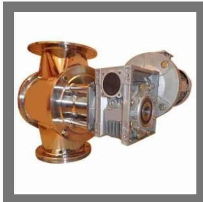
Rotary Airlock Valves