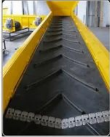
V Belt Conveyor