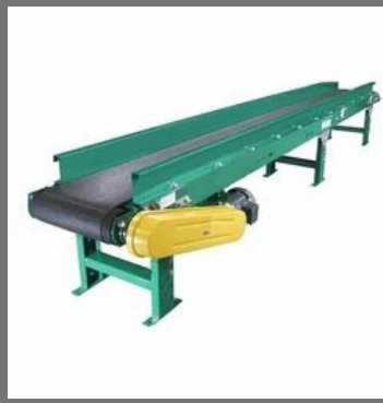
Flat Belt Conveyor