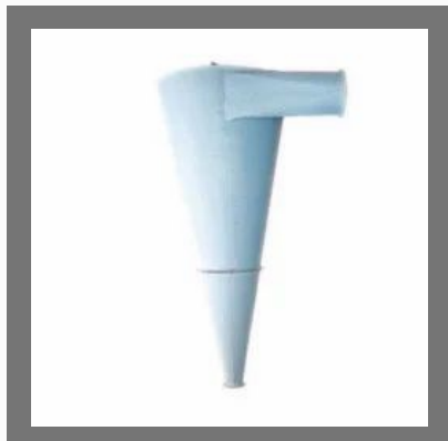
Cyclone Dust Collectors