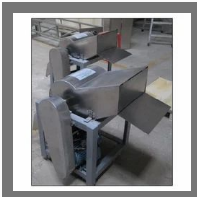
Industrial Ice Crusher