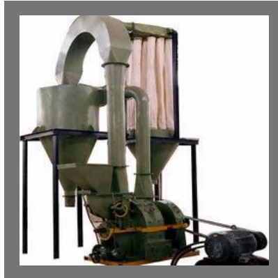
Impact Pulverizer Machine