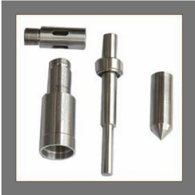
Precision Machined Components